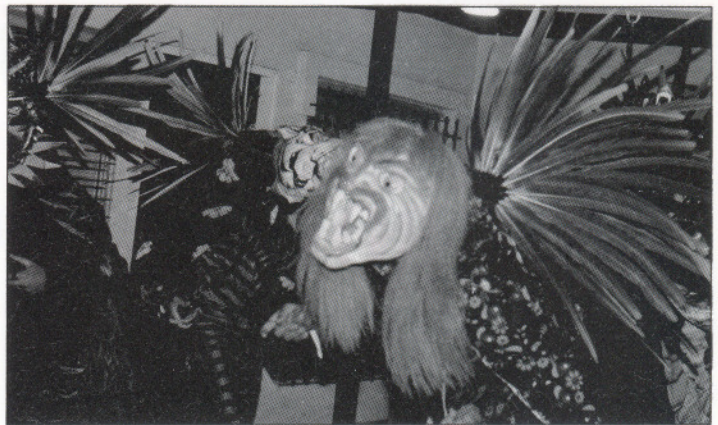
Panamanian dancers using macaw feathers.