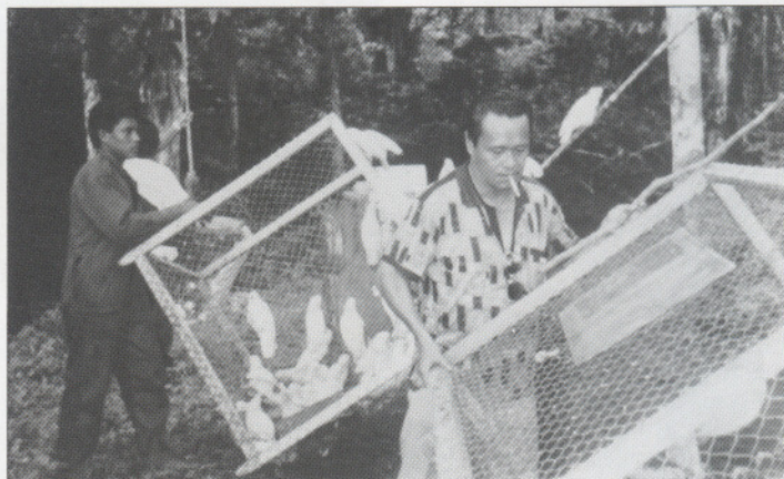
Goffin's Cockatoos being released into the forest. The release was made under the supervision of the local Indonesian authorities.