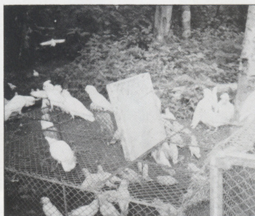
The freed Goffin's Cockatoos begin to fly to freedom.