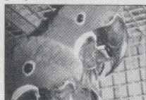
Stolen to order?

Police were alerted immediately. During routine checks of vehicles in Cambridgeshire, all five birds were discovered in the boot of an Audi. Two men have been released on police bail and a third has been remanded in custody pending trial. Police are still investigating the theft of the first group of birds.