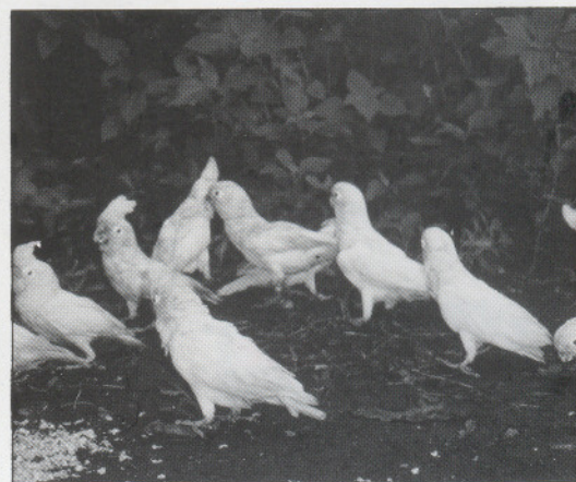
The Goffin's Cockatoos pick up food from the forest floor.