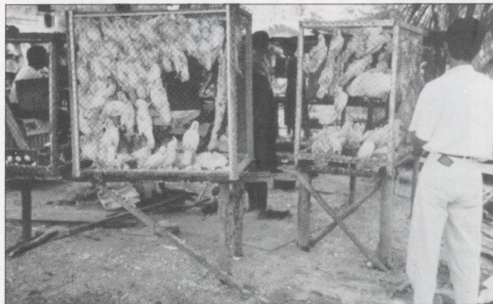
Captive Goffin's Cockatoos, held in cages on a farm near Saumlaki, Tanimbar, Indonesia. Over 500 were kept there for one year.

We will keep our members informed on future developments on Tanimbar. What is certain is that the Trust will think very carefully before it allows itself to get involved in a similar situation in the future. From the parrot welfare point of view it was rewarding to have 319 cockatoos removed from miserable conditions and returned to the wild, but it has to be conceded that insufficient science was applied to the release.