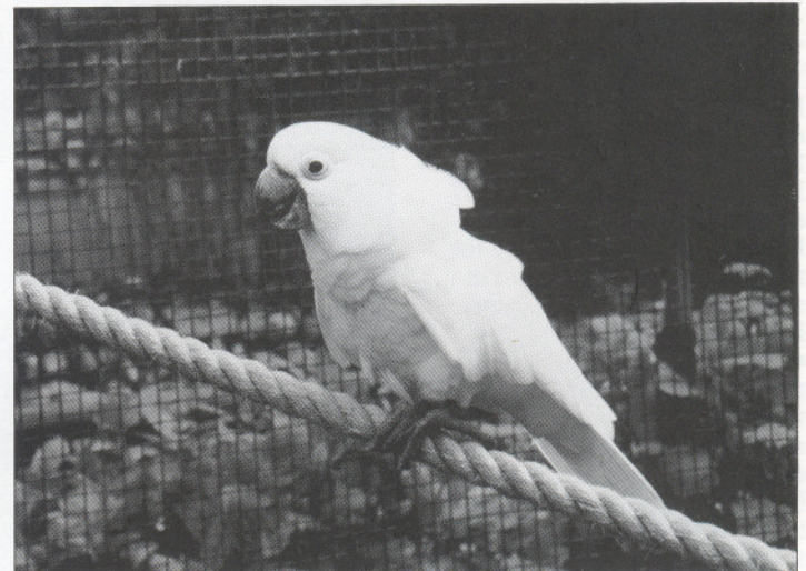
Parrot in captivity: A rare Blue-eyed Cockatoo demonstrating his preference for a rope perch.

What did we ever do to deserve this? For millions of years we flew free, evolved into hundreds of ingenious and beautiful designs to fit in with nature's plan, took our chances in a thousand wild places and succeeded despite every adversity. Then, in just a few recent moments of recorded time, we became the most sought after, most valuable birds in the world. We are traded like rare jewels, we are smuggled and even stolen. But we are not inanimate objects, we are living creatures with special needs. Above all we are birds and we need to fly. Those of us which are still free, please leave us free. For those many of us in captivity, I must ask for us to be treated with compassion and respect.