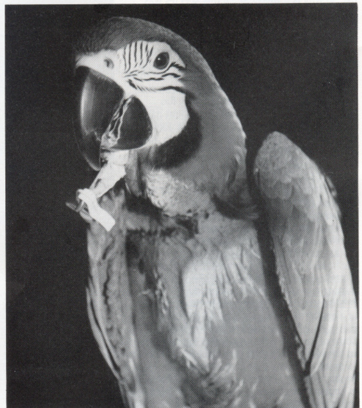
Stacy - 5 month old Blue/Gold Macaw with massive crop burn.

This dreadful story illustrates the fact that young hand-reared parrots should not be sold until they are fully weaned. Ed.