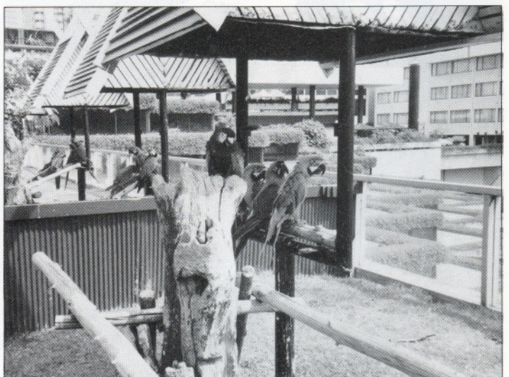
Parrots at Ambassador Hotel, Bangkok.

Another member writes to us about a large group of parrots being used as part of the decor of the Ambassador Hotel, Bangkok. The photograph shows a small section of them, including Scarlet and Blue and Gold Macaws. Palm Cockatoos and Hyacinth Macaws are also there, making up a total of over 100 birds. In March we wrote to the managing director of this hotel to ask how the birds came to be there, and if they have any plans for putting the endangered species into breeding facilities. No reply so far, which is not a surprise. If any reader wishes to add his or her voice to our enquiries, write to: Managing Director, Ambassador Hotel, SO1 11-13, Sukhumit Road, Bangkok, Thailand.