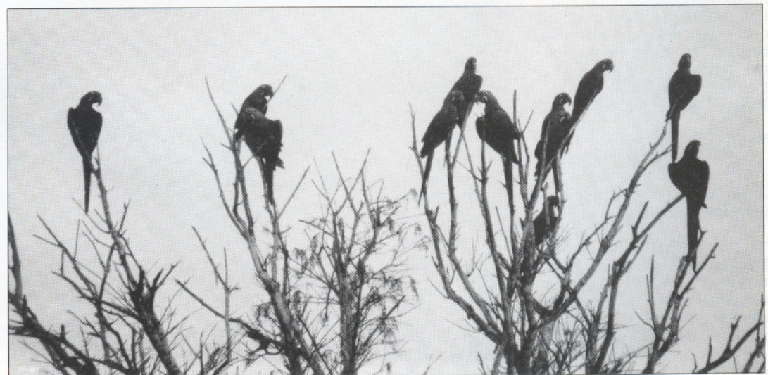
Parrots in the wild: Hyacinth Macaws at a typical roost.