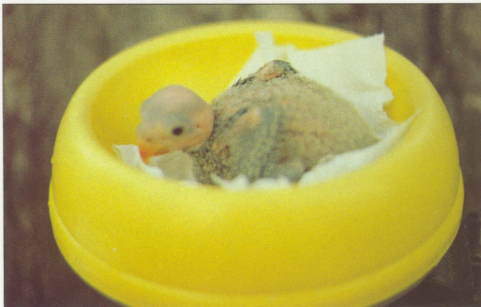
Looks a bit like a dog's breakfast, but this is actually the rarest parrot in the world.

The Echo parakeet project is financed and managed by the Jersey Wildlife Preservation Trust in co-operation with the Conservation Unit of the Mauritius Government. Generous funding is received from the Mauritius Wildlife Fund and the World Parrot Trust.