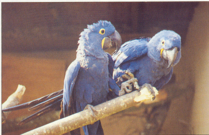
The female of this pair of Hyacinth Macaws died as a result of Darkers treatment. The male, who has been at Paradise Park for 23 years, is now without a mate.

Darker was subsequently jailed for four years.