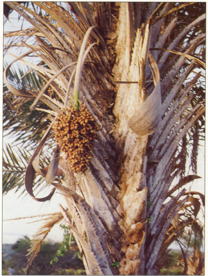
This is what the Lear's Macaw is searching for - a Licuri palm with a fine frutescence.

A tree augur may be necessary to prepare planting holes for the