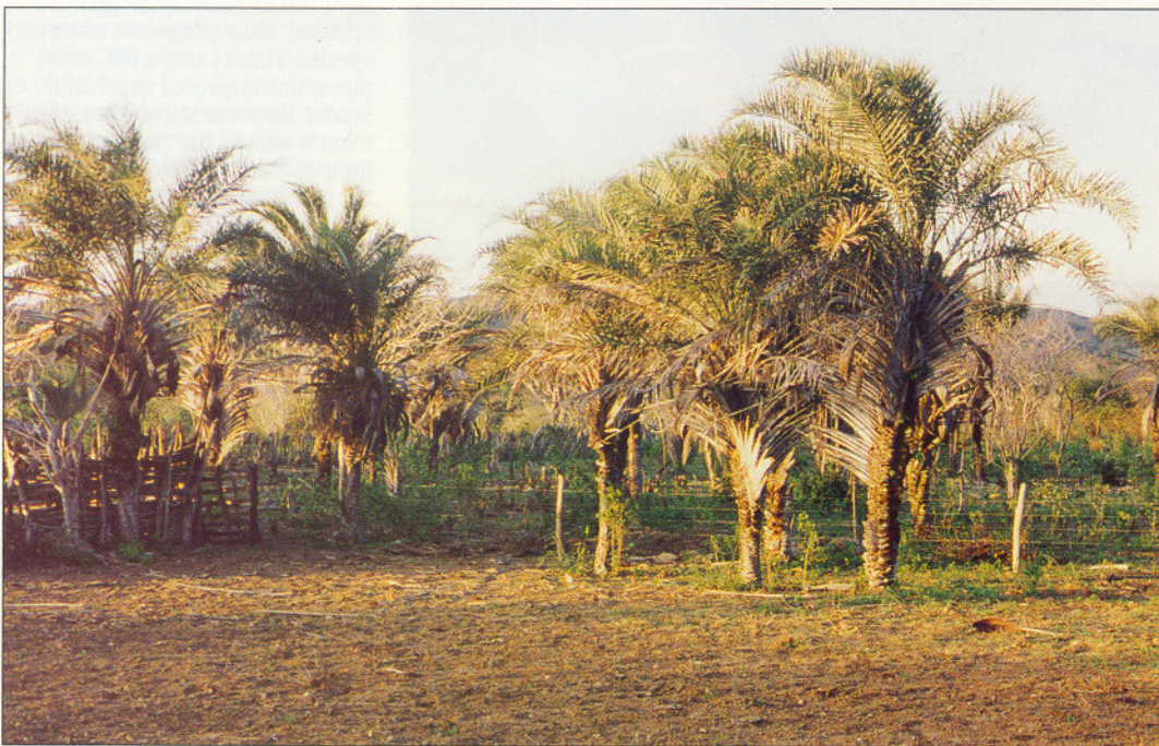
A good plantation of Licuri. It takes 12 to 15 years for these palms to fruit.