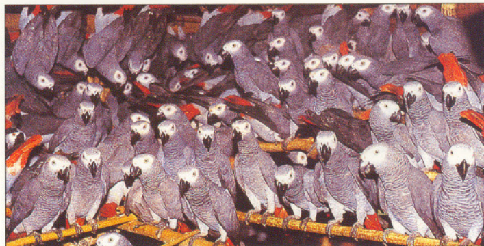
African Grey Parrots in a dealer's premises. This ghastly picture is actually used as a postcard for tourists to send home from Cameroon.

The World Parrot Trust will do what it can to monitor this situation, and further reports will be made.