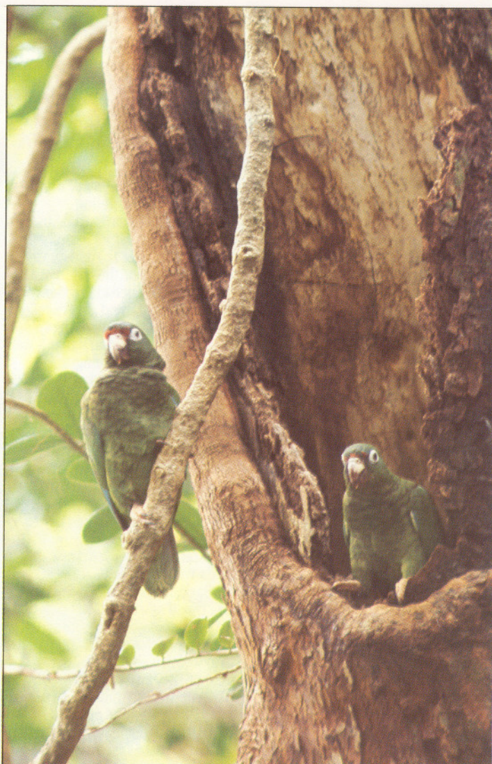
Puerto Rican Parrots nesting successfully in a rehabilitated cavity of a palo colorado in 1975. Prior to patchwork, this site was thoroughly wet inside.

In the long term it is important not only to resuscitate the Luquillo Mountains population but also to establish new wild populations in other forested regions of the island, such as Rio Abajo Forest, where a second aviary for the species has recently been created.