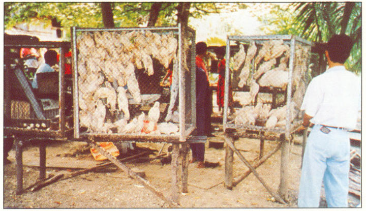
This is how the Goffin's Cockatoos were being kept, before we arranged their release back into the wild.