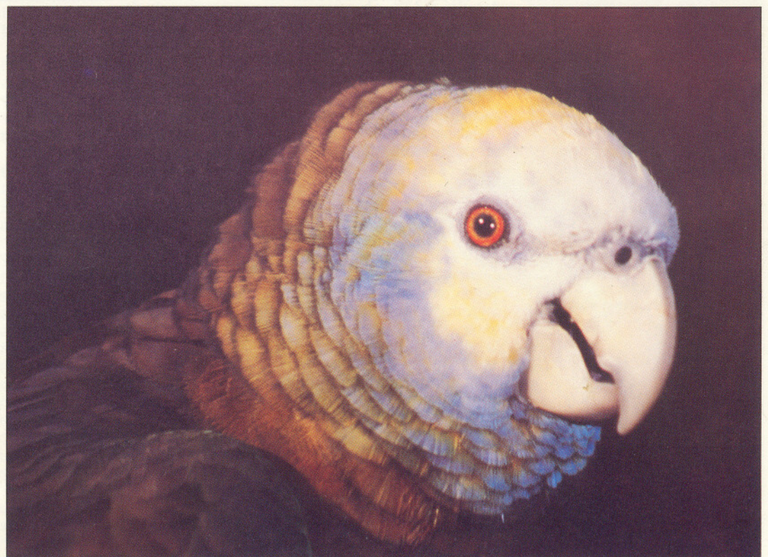
St. Vincent Parrot. See report on Page 10.

At the fun-packed 'Vegas Night' a framed proof of our new Lear's Macaw limited edition print was