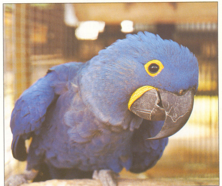
Photographed at Busch Gardens, Tampa, Florida in December '93. Lear's Macaw on the left, Hyacinth Macaw on the right, hogging the camera.