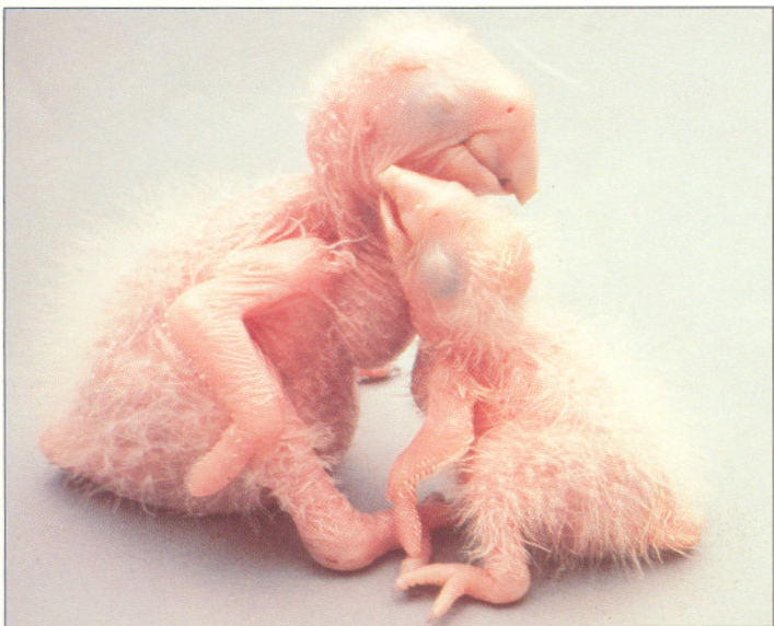
Greenwinged Macaws four (39 grams) and six (106 grams) days old. Baby macaws require correct nutrition, heat and humidity to survive.

The concept of MAP was that those that knew the birds the best (the bird breeders and the avian veterinarians) would come up with guidelines that other breeders could follow to improve their facilities to match minimum standards for bird care. In order to