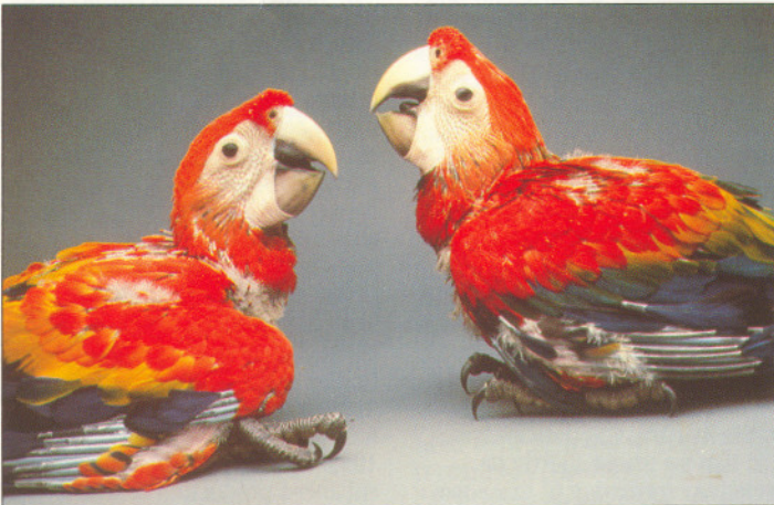
There are geographical variations of some species of parrots, including macaws. These two Scarlet Macaws represent two different types; a wide band of yellow on the right (1045 grams) and a narrow yellow band on the left (1210 grams).