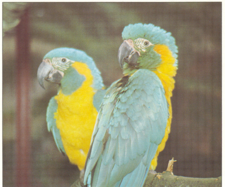
Blue-throated Macaws at Paradise Park.