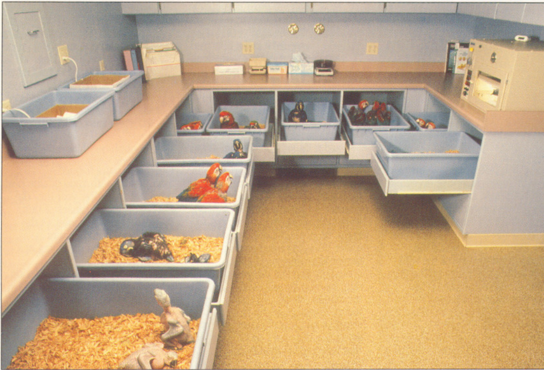
The nursery at the author's facility provides individual bins for each clutch of chicks. Laminated walls and a linoleum floor provide easy to disinfect surfaces.