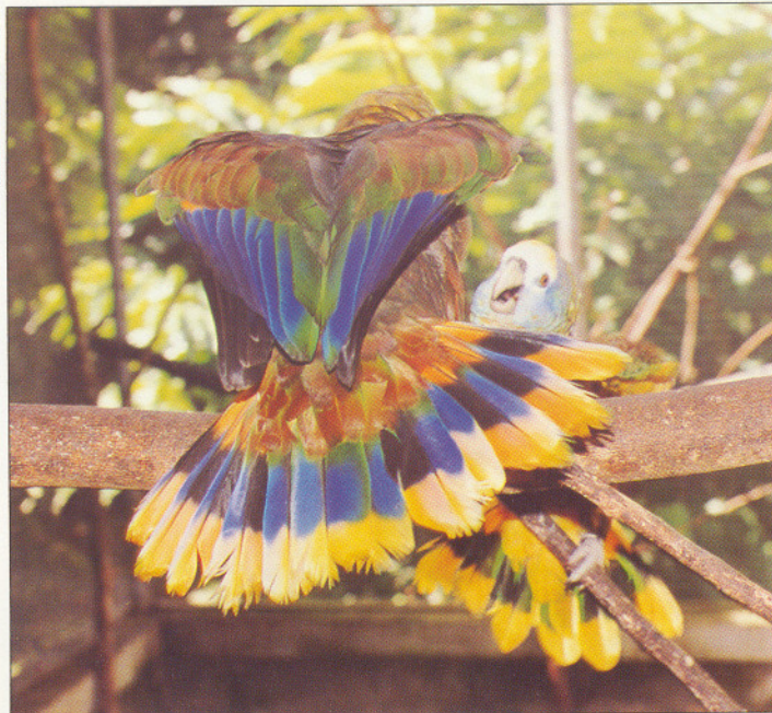
A breeding pair of St Vincent parrots in the government aviaries.

At that early hour, parrot calls came from all directions. Sightings of pairs flying overhead were frequent. Initially, the birds were silhouetted against the dull sky. As the light intensity increased slightly, the brilliant orange patches in the wings were lit against the green backdrop of forest. For an hour or so, the forest vibrated with their calls as they greeted the day and flew off to find food. By about 7.45am the calls grew less frequent but we lingered for an hour, hoping for a few more glimpses.