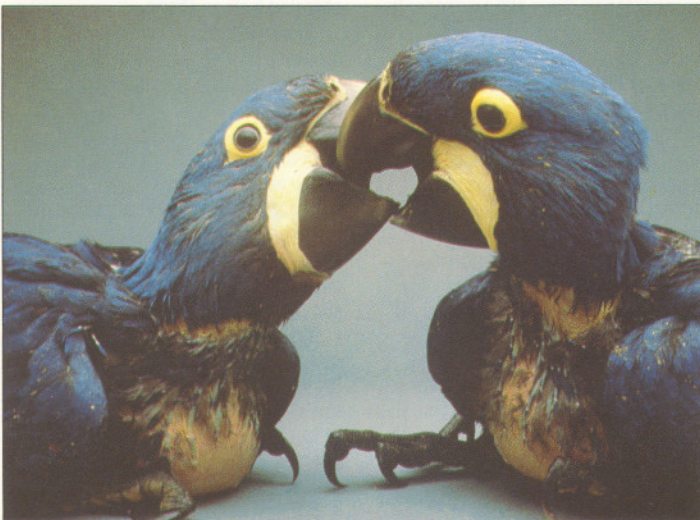
Hyacinth Macaws at 72 and 76 days old. These healthy babies weigh 1510 and 1600 grams respectively.

birds can only be enhanced. A sample form of the questionnaire and the explanation is available to the aviculturist prior to the inspection so they can see what criteria are being considered for certification.