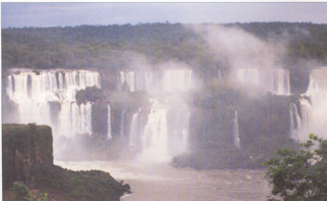
Iguacu Falls at the junction of Paraguay, Brazil & Argentina.

The Iguacu falls are reached by crossing the Parana river into Brazil. They are situated within a