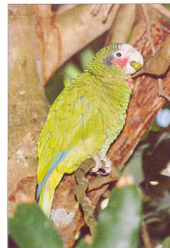
Cayman Island Parrot, ( Amazona leucocephala caymanensis ).

About 80 birds are registered but only 7 Cockatoos are captive bred and not so good breeding