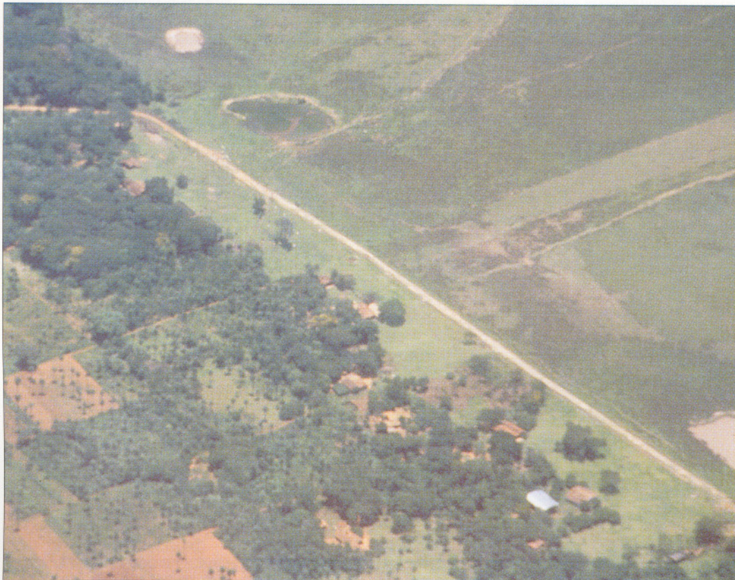
Roadside forest remnants, Paraguay.