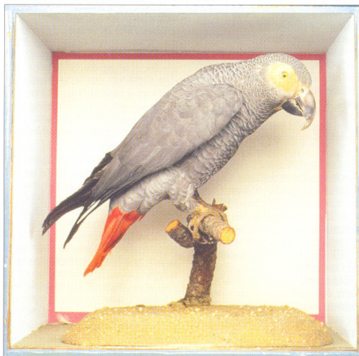
Houdini's African Grey

resided at the American Museum of Natural History in New York City.