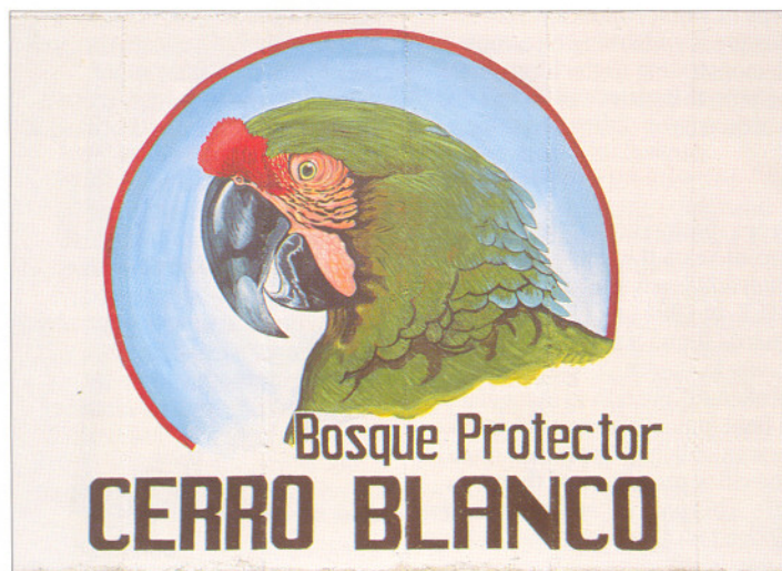
Sign at main entrance BPCB, Guayaquil, Ecuador.

Based on the above information it is recommended that funds and other resources are first directed to ecological studies and conservation management actions for guayaquilensis in south-west Ecuador, specifically starting with the Bosque Protector Cerro Blanco