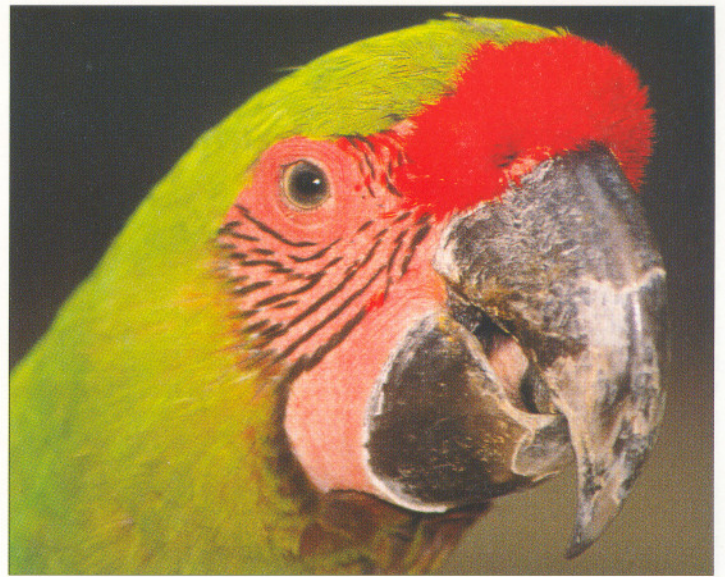
Buffon's Macaw, Ara ambigua guayaquilensis .

Originally 2,000 ha in area, the BPCB has recently been extended