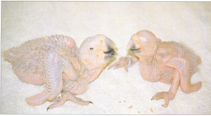
Ara ambigua at 16 & 10 days.