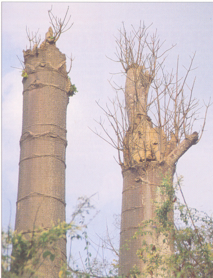
Buffon's Macaw nest in Pigío tree ( Cavanillesia platanifolia ).

In regard to the most effective use of funds and other aid for the conservation of guayaquilensis , Buffon's macaw reflects very well the situation of many other psittacids, which is that we have virtually no detail on its ecological requirements and life-cycle to confidently formulate and implement conservation management plans. To get this information, it seems to make sense right now to concentrate efforts on an area with guaranteed protection, an existing infrastructure which can greatly assist the collection of valuable field data as quickly as possible. Thus, within the BPCB, identification of other active nest-sites is necessary, as is the scientific monitoring of these