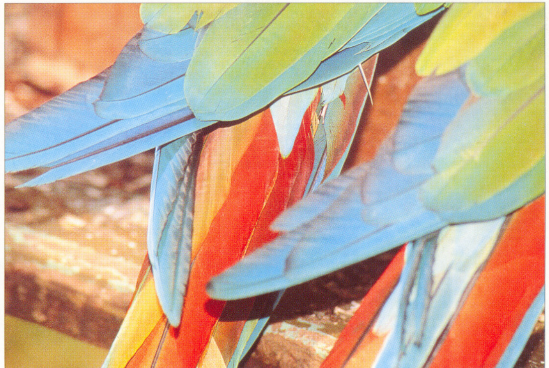
This is the spectacular plumage of Ara ambigua guayaquilensis .

There is now only one large, relatively uninterrupted area of forest, which is north of the Rio Guayllabamba in the provinces of Esmeraldas, Imbabura and Carchi, and includes two forest reserves