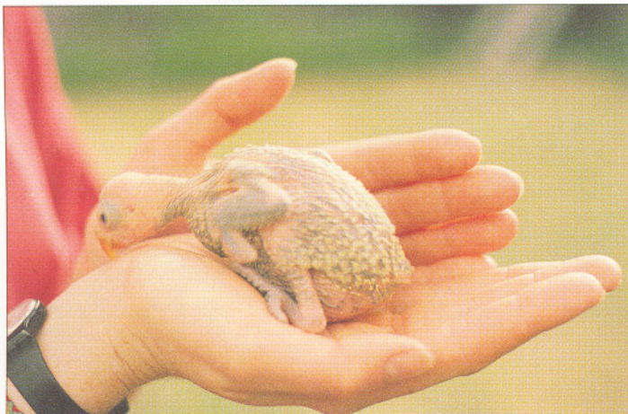
13 day old Echo.