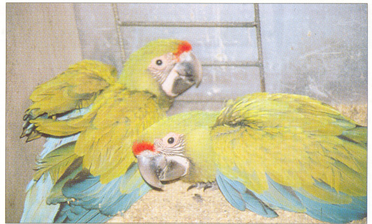
Ara ambigua at 68 & 62 days.

Three days later I had to remove the second young Buffon's which was found to be quite thin.