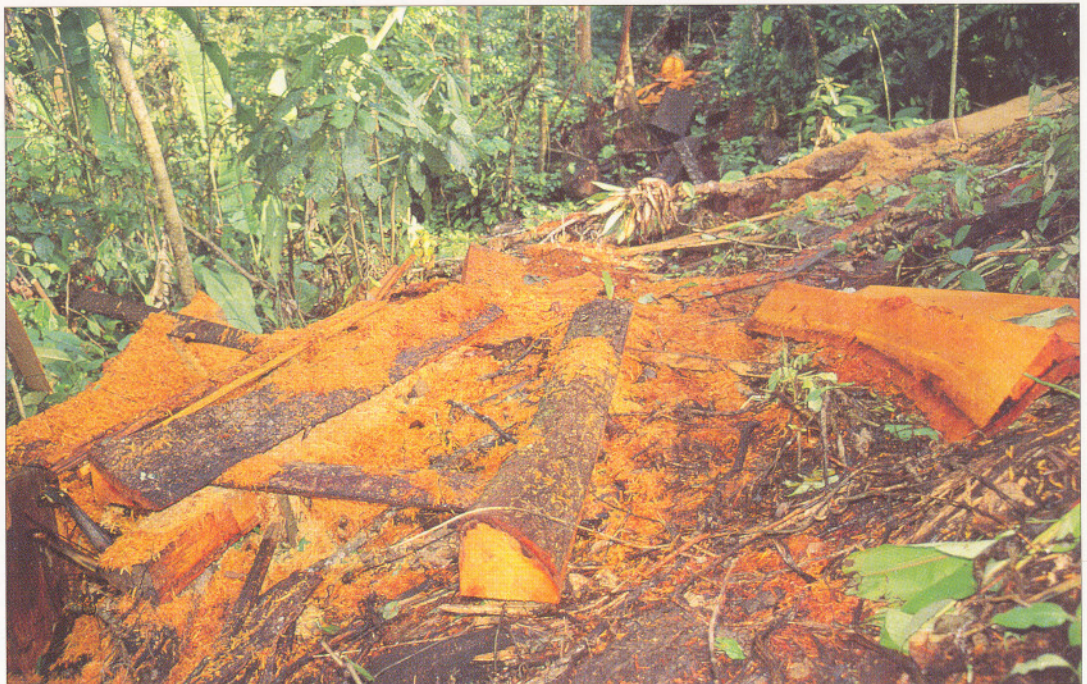
Effect of timber felling in wet tropical forest, San Juan, Esmeraldas, Ecuador.

It will of course consider articles or letters from any contributor on their merits.