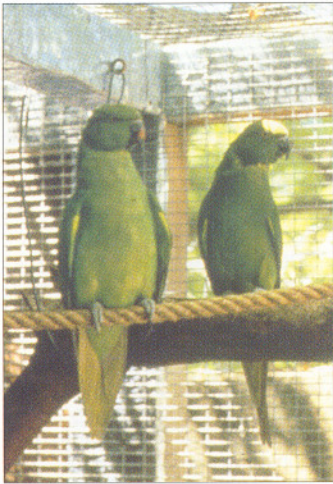
Pair of adult Echos in Mauritius aviary.

This year we are pleased to report the most productive season for the Echo Parakeets since the mid 1970's. We began the season with four pairs in the wild and one in captivity. All started breeding early, perhaps in the wild birds in response to abundant food supply following a flush of growth after last February's big cyclone.