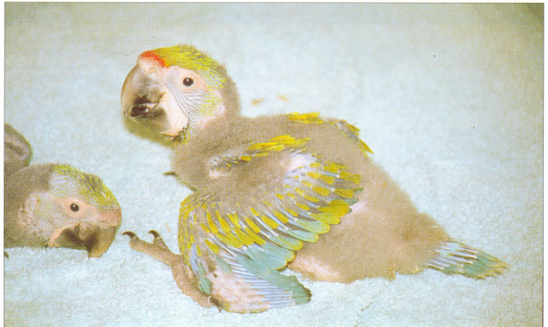
Ara ambigua at 37 days.

On December 3 it was removed from its parents and placed in a much larger aviary with some Military Macaws Ara militaris . Three of these had been hand-reared. As I had just removed them from the hand-rearing room I continued to feed them warm rearing food from the spoon once daily. I also handed them cracked