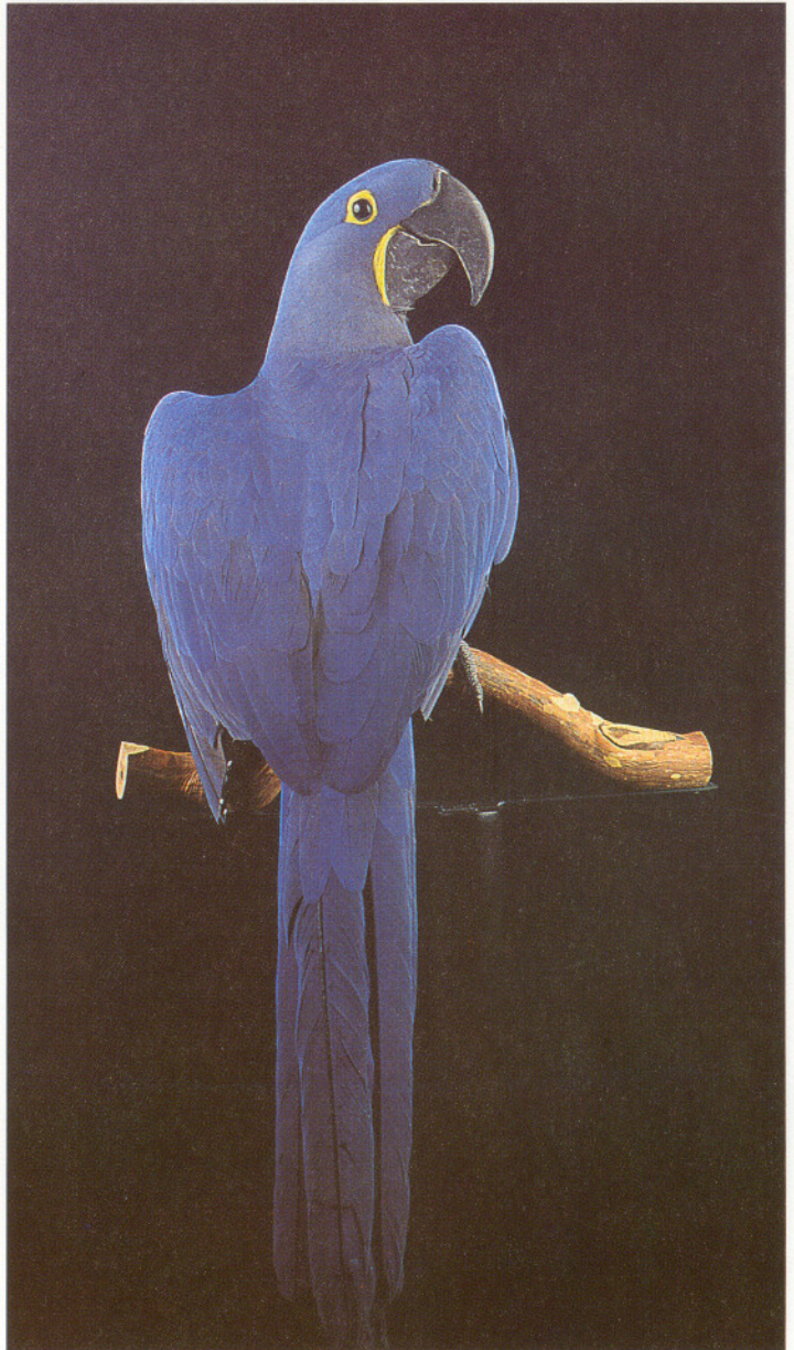
The sheer beauty of the Hyacinth Macaw is its downfall.

Bearing in mind the previous points, I would like to suggest six golden rules: 1) continue to take good care of and breed your birds; 2) never buy anything other than sustainably-produced, aviary-bred birds; 3) read about the real conservation situation of different parrot species in the wild; 4) become a member of the World Parrot Trust (WPT), International Aviculturists Society (IAS), and other groups working successfully to conserve wild parrots; 5) participate in trips to key field projects; and 6) inform your local bird club and avian veterinarian about the work of WPT and IAS,