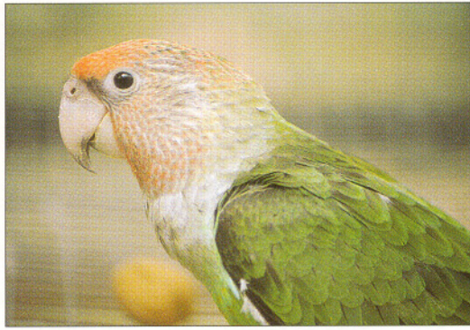
The same female 24 days after leaving the nest, i.e. at 106 days.

avoid keeping two adult females together. I learned the hard way with two female Red-bellied Parrots P. refiventris which were placed together in one cage for quarantine. One soon killed the other. There is no problem in keeping male Poicephalus together. Indeed, I recall a breeding pair of robustus on exhibit at Vogelpark, Walsrode, in the 1970's. An extra male was kept in the same cage as a breeding pair. Only once have I ever known aggression to occur between male and female. In this instance the female was killed by the male, probably because he was ready to breed and she was not.