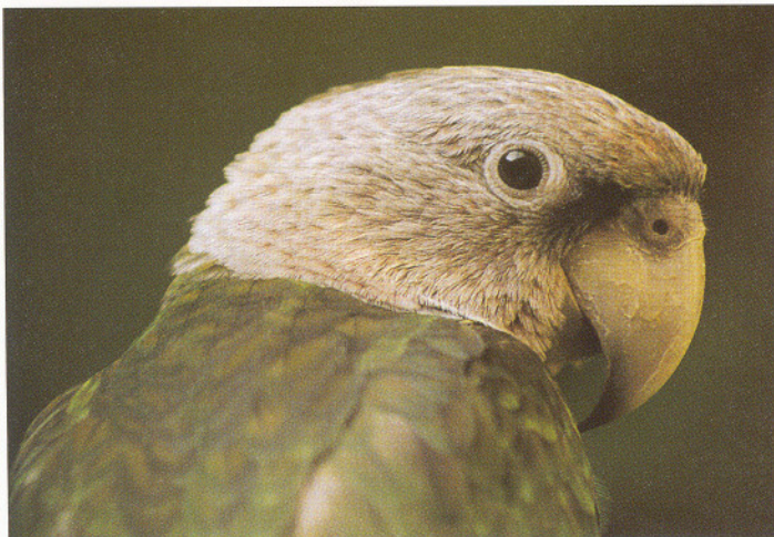
Young male fuscicollis bred at Palmitos Park.

In species of the genus Poicephalus females are dominant and bolder. Males are more gentle. One must