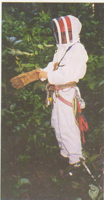
Bee suit in action.

I am sure that these suits will enjoy an active life!"