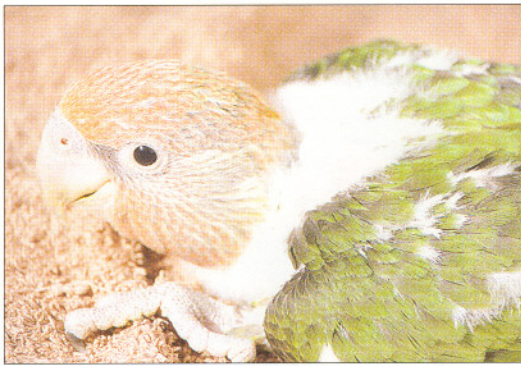
Young female produced by the pair whose female offspring have the head nearly all orange in nest feather (here aged 49 days).