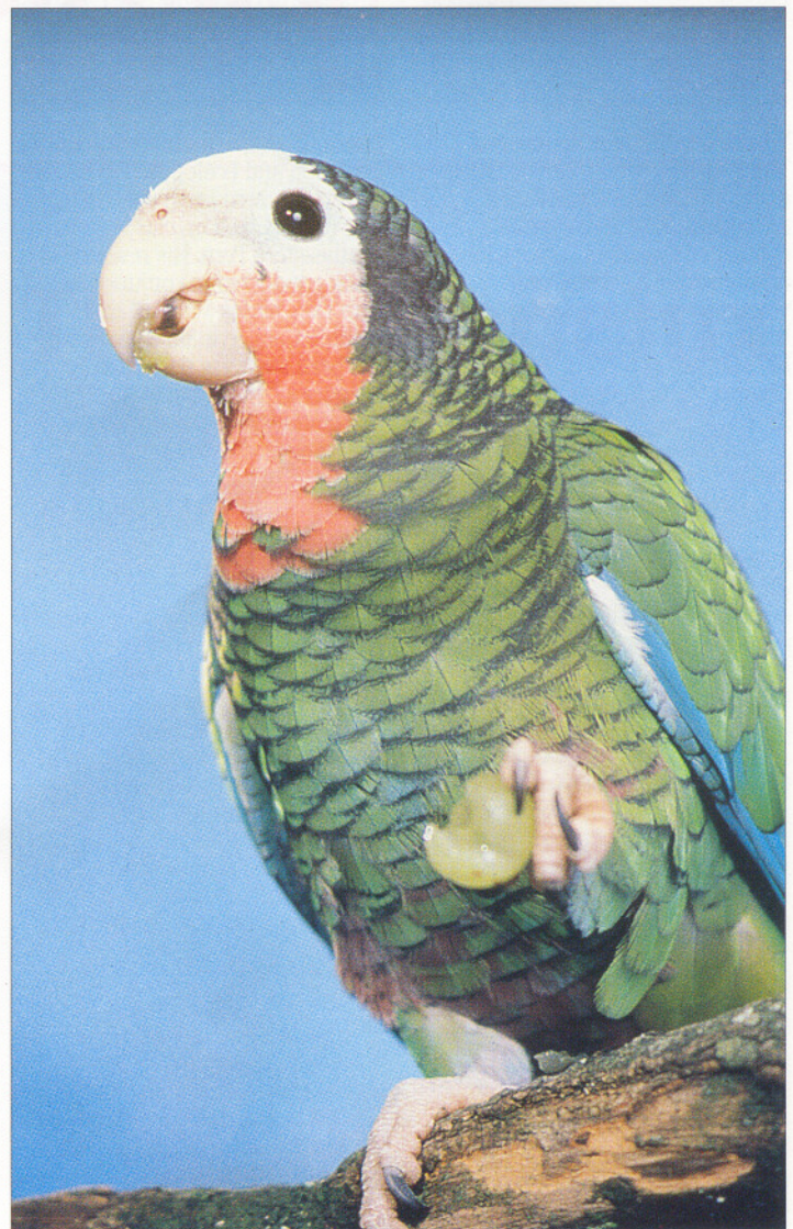
Is this bird a 'subversive undercover wildlife agent'?

This can only be done by preserving the habitats within which the parrots have evolved their survival skills over millions of years. Other flagship species have been used successfully to