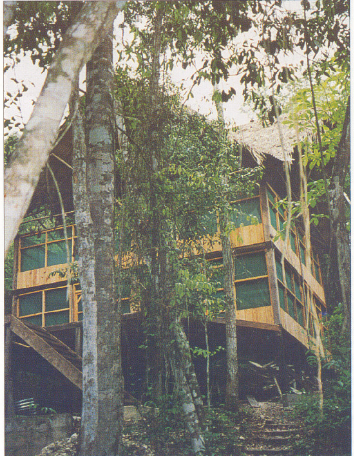
Sleeping quarters for researchers and volunteers at ARCAS.

The challenge when dealing with the young macaws confiscated during transport is their rehabilitation and re-introduction to an entirely wild existence. Many pet-trade poachers target chicks because of their relative ease of transport and the consumer demand for young birds; these are the birds that eventually make it to the Rehabilitation Center. Although most would require extensive hand feeding, human contact would be kept to an absolute minimum. For a successful release, a type of survival "training" must begin almost immediately upon arrival. In order that they learn their true position in the forest canopy fledged chicks will be placed in cages suspended at different heights above the forest floor.