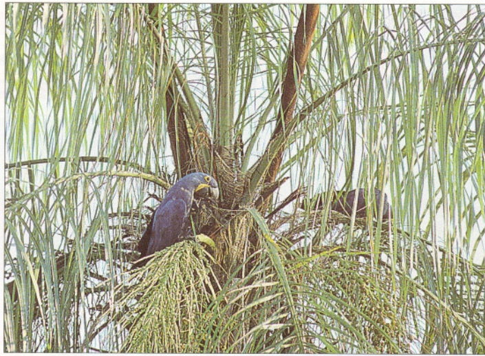
Hyacinth Macaw in the wild. Numbers reduced from around 100,000 forty years ago to perhaps 3,000 to 5,000 today.

It will of course consider articles or letters from any contributor on their merits.