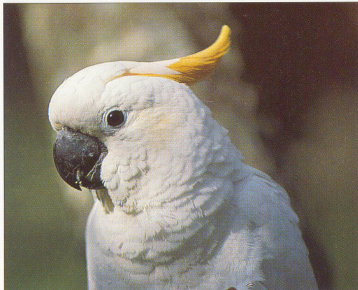
Citron-crested Cockatoo, bred at Paradise Park, UK.