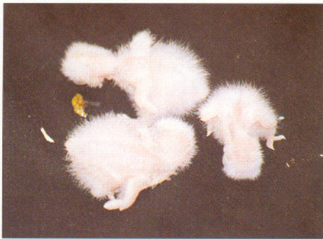
Chicks aged 2 and 4 days and, the chick on the right, newly hatched.