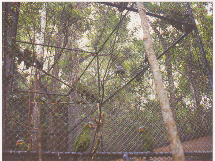
Amazons in conditioning cages prior to release.

Of course, these efforts require monetary support and donations of building materials in order to be