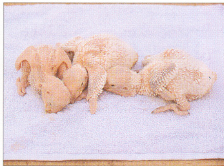
Chicks aged 20 and 21 days. All the young depicted are parent reared.