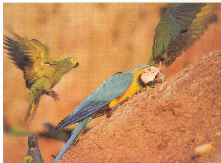
Parrots at the Tambopata clay lick.

Among those consequences are extinction of the Australian species. Roughly 80% of the birds die in transit, according to some