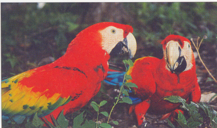
Scarlet Macaws eating decaying limestone & soil on a hill at the Villa Maya Hotel.

Some macaws are no longer capable of surviving on their own in the wild. These include birds who have spent too much time in captivity and have imprinted on humans, and those that are too old or debilitated to survive in the wild. Their dependence on humans for food and protection precludes them from an entirely free existence. These animals, if deemed in adequate physical condition, are likely candidates for the breeding program. The breeding facility, though in its infancy, is based in the Villa Maya Hotel only a few kilometers from