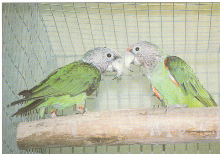
Brother and sister fuscicollis aged 10 months, the female (on the right) does not yet have the full amount of orange on the forehead.