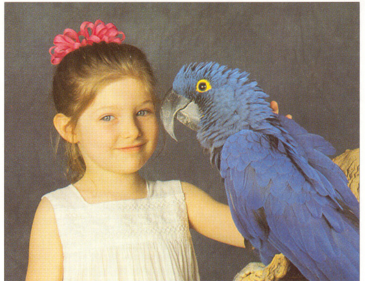
Left, Csilla, right, Sasha.