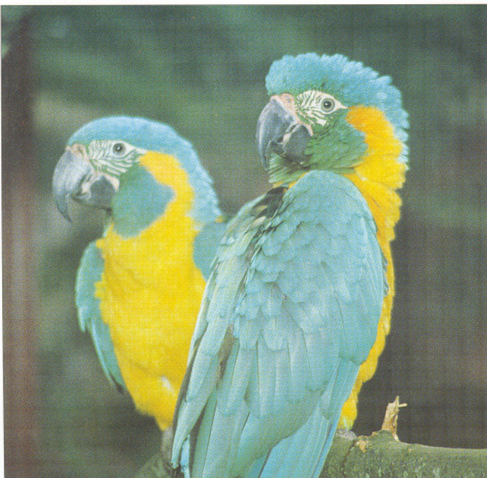
Blue-throated Macaws. Quite well established in aviaries, with numbers that may equal those in the wild.

As part of the conversion of local parrot trappers to parrot protectors, we have recently purchased a used dirt bike to be used by one of our new parrot protectors for patrolling key points along 100 miles of dirt roads in Bolivia. Our parrot protector, whom WCS converted from trapper to protector two-and-a-half years ago with excellent results, is a very rugged and determined field man who is more than happy to earn a living by protecting active nests of Blue-throated Macaws. Recently a parrot smuggler who is a well-known middleman in a major Bolivian city contacted our macaw guard and tried to convince him to capture and sell the Blue-throated Macaws under our man's protection. Our man rebuffed the offer and told the smuggler to give up on any attempts to locate, trap, or buy birds of this species. The smuggler threatened our man, telling him that he might have an