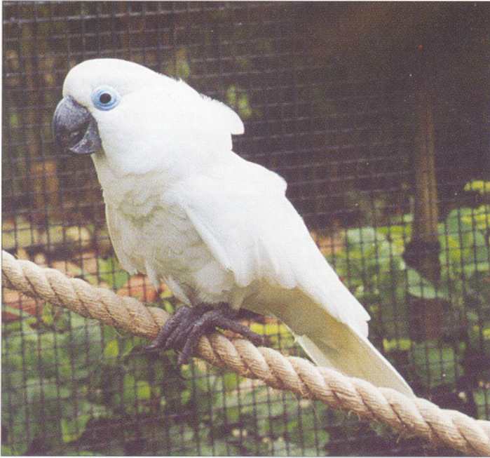
Blue-eyed Cockatoo. Very few in captivity. Hopefully still safe in its remote habitat in New Britain and New Ireland.

unfortunate accident if he tried to block him (the smuggler) from getting Blue-throated Macaws. Our man, who is a burly, field-hardened, bearlike fellow with a gentle disposition, replied calmly that the smuggler could say what he wanted, but he would never get near the wild birds. Our man informed me that this urban middleman is absurdly scared of the rain forest and certainly would not be able to locate or threaten any wild birds as long as he was on the job protecting them and patrolling. Furthermore, our man has many family members and friends in the towns and villages in the region that includes the macaw nests. Thus, no-one suspicious can visit the area without our man being tipped off immediately. Finally, the owners of the various gigantic properties on which the macaws are nesting are co-operating fully with our man, who can drive his dirt bike anywhere on their lands to protect the macaws.