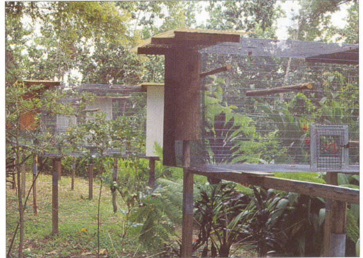
Puerto Rican parrots at Río Abajo.

Most of the Puerto Rican Parrots showed behavioural patterns usually associated with stressful environment, human imprinting, lack of parrot socialisation experiences and chronic compulsive habits, some appeared unreasonably aggressive. More than half showed some degree of