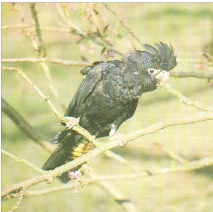
Red-tailed Black Cockatoo. This bird should be in Australia, but was smuggled into Britain as an egg, hatched, reared, and then confiscated by the authorities.

The principal approaches to protecting endangered small species of New World parrots are creating well-protected reserves of the best patches of remaining habitat. The best approaches or justifications for creating and protecting such reserves are one or both of the following: 1) watershed protection to protect water supplies or to avoid landslides, floods, and siltation of hydroelectric reservoirs, all of which benefit downhill or downstream urban or agricultural communities and road systems; or 2) public-relations-oriented promotion of protection and viewing of a larger, often mammalian flagship species, such as a beautiful monkey (e.g. the Golden Lion Tamarin or the Woolly Spider Monkey, both of SE coastal Brazil, or the Spectacled Bear in parts of the Colombian Andes). Of course in many situations, larger parrots like Amazons and large macaws could make excellent flagship species for conservation projects for forest reserves in otherwise deforested parts of the tropical Andes or southeastern or coastal Brazil, but unfortunately, these large species usually disappeared entirely from even large patches of remaining forest decades before the reserve or the small parrots in it were in direct danger of destruction. This can be seen clearly in the twin parks of the Iguassu Falls National Parks of Brazil and adjacent northern Argentina. The Green-winged