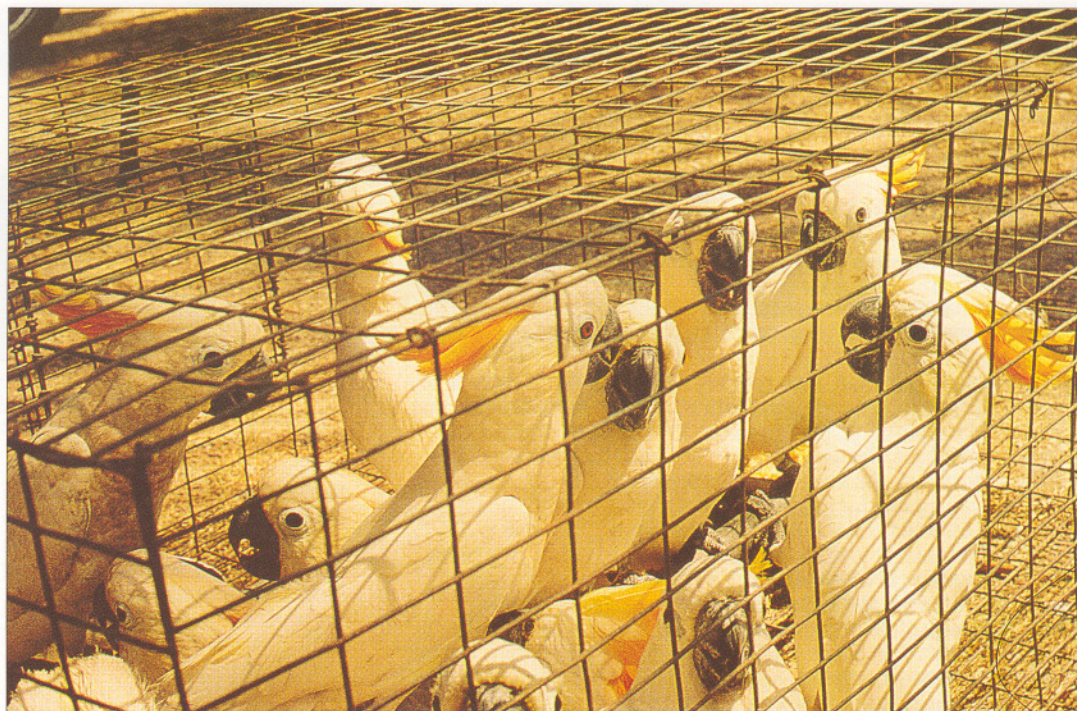
Illegal Jakarta-bound cockatoos impounded at Sumba's airport.

The data on nest characteristics were then used to calculate how many nest-sites might be available to the parrots in a given area in each of the forest patches surveyed. These figures were then related to the density of each parrot species occurring in each forest patch. The results were the most important of the study. The more nest-sites there were in a forest patch then the more parrots the forest patch would hold. The relationship between nest-site availability and bird density was as