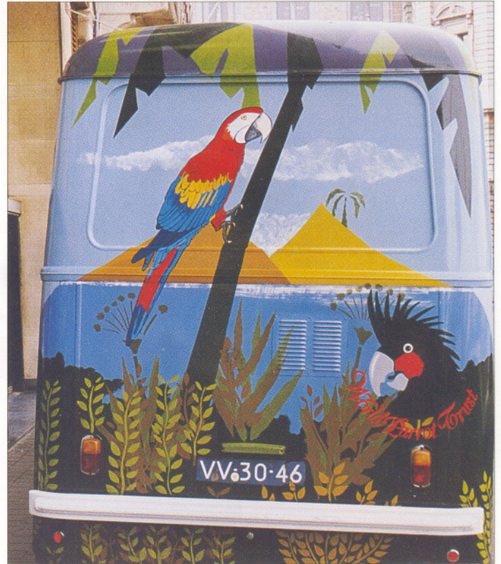
The back end of the bus