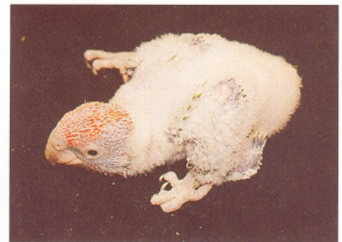
Chick hatched 25/11/94 aged about 31 days.