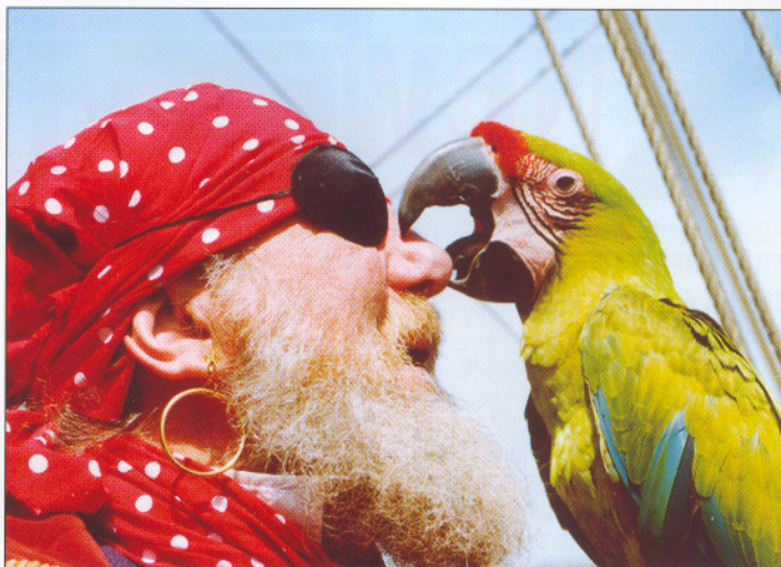
Parrot disciplines pirate. Parrots are show business too.

Our cherished free market economy was designed for widgets, not for endangered animals. If all commercial aspects of aviculture do not realize this then, as they fear, they will be regulated out of business. The only way to remain autonomous is to self regulate; to implement serious and punitive regulations for improper practices (hybridization, line breeding, selling unweaned birds, manufacturing unsafe products, advertising seedmixtures as being an adequate diet) and to make mandatory some very simple things like sanitation, holding back domestic stock for future breeding, minimum cage/flight sizes, mandatory record keeping and the like. There is some movement in this direction, but it is generally voluntary and "has no teeth" in the event of non-compliance. But progress is progress and credit must be given to