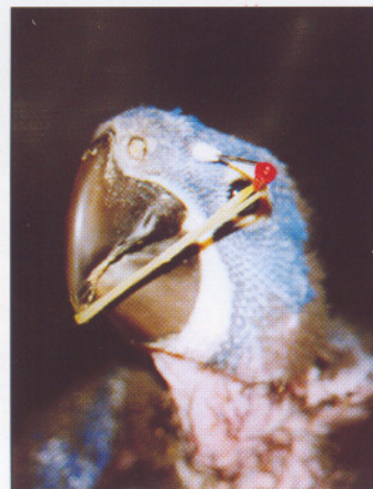
The orthodontic band is attached.