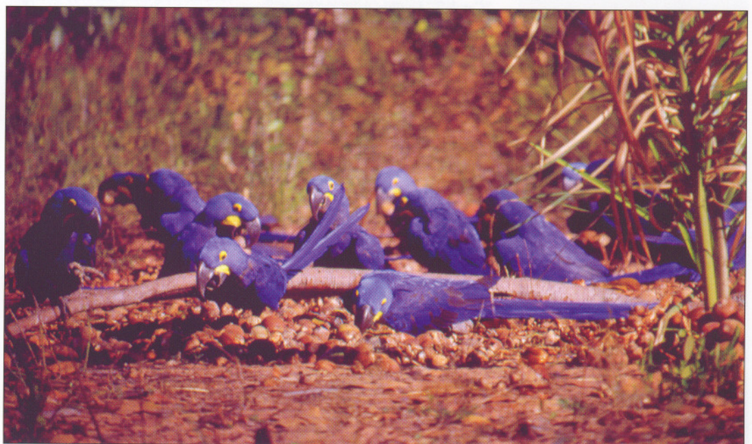
10 Hyacinths feeding as seen from blind.

Arriving at the camp we were greeted with a filling meal and individual huts for each couple complete with mattresses, new sheets and unneeded mosquito netting. Sleeping arrangements were quite comfortable.