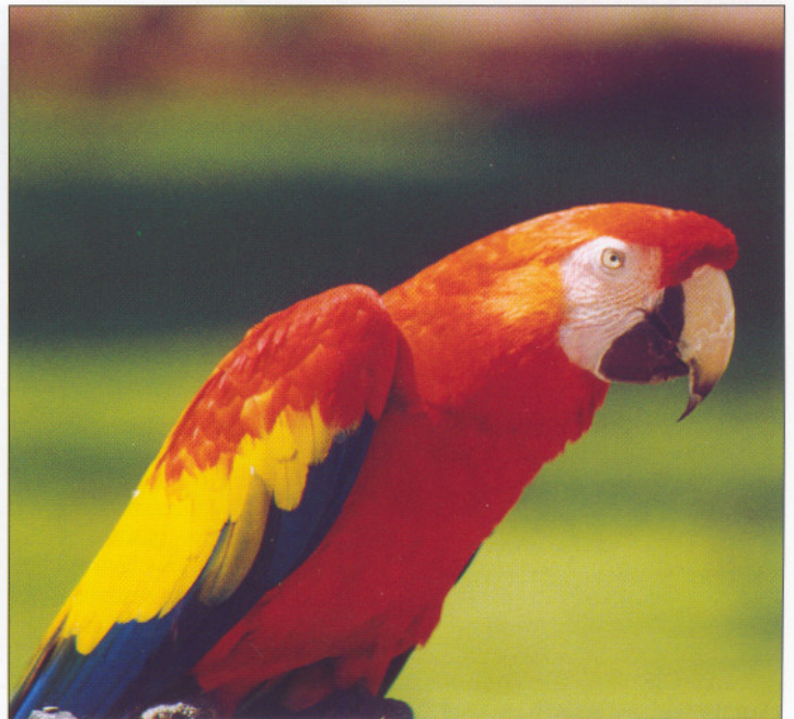
Free flying Scarlet Macaw at Paradise Park, UK.

Wild-caught birds were not easy to breed and the myth grew that the Greenwinged Macaw had to be