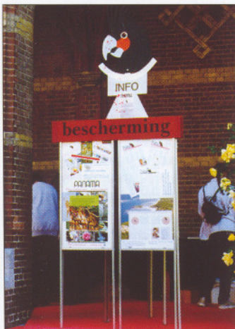
Bovendonk centre, Hoeven

We can conclude that it was a well organised and most important well received happening by the attendees. Thanks to the