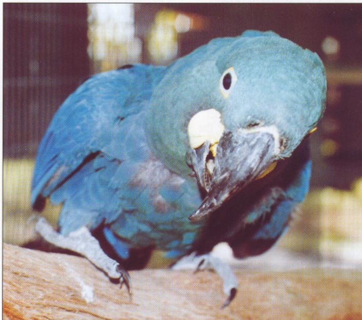
Lear's Macaw. One of the two females held at Busch Gardens, Florida.

Macaws are exceptionally intelligent creatures. So many are condemned to a prison-like existence, presumably because it is expensive to build real aviaries. Yet the cost is small when one considers the high return many breeders gain by continually removing eggs. In addition to the moral issue, I believe that over the course of several generations of birds bred in such cages, small degenerate young will be produced. The macaw is one of nature's most magnificent creations. We should deem it a privilege to have such birds in our care. We must ensure that the birds we breed are the equal in size and appearance to their wild-caught parents or ancestors. If we cannot do this, we should keep Aratingas instead.