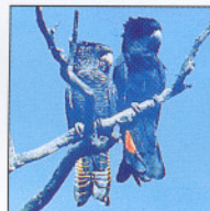
Red-tailed Black Cockatoo