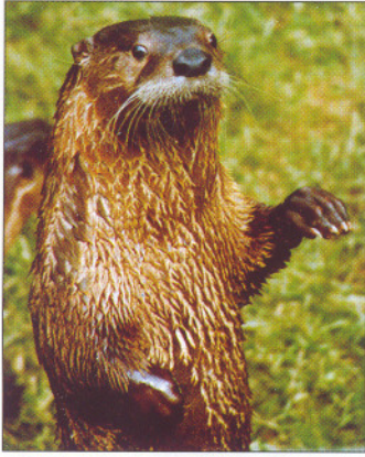
North American Otter communicating with his public.

potentially successful release programme.