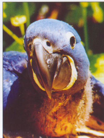
Harley with straight beak.