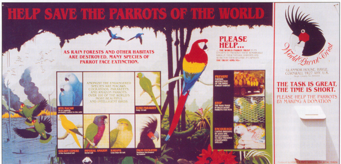
Above: This poster has helped in raising funds for WPT in many zoos and bird parks, and at bird shows and conventions. Two sizes are available from WPT-UK: 2m x 1m and 1m x 0.5 m.