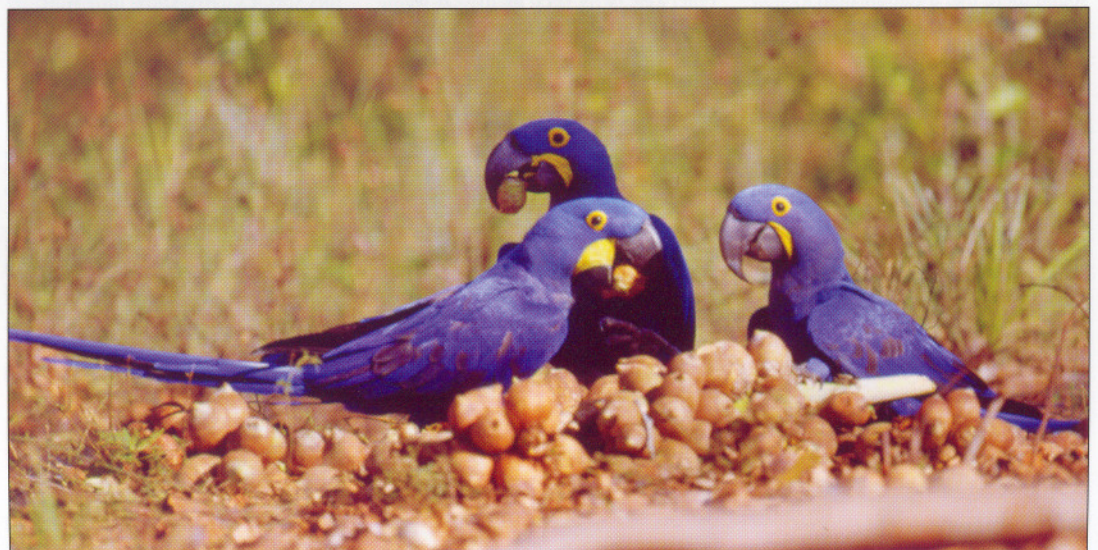
A small group of hyacinths feeding.