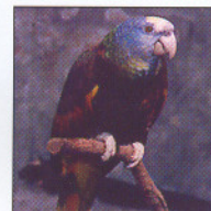
St. Vincent Parrot