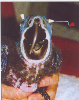
Young hyacinth (Harley) with curved beak and 'handlebars' fitted.

Overseas members may not know that the Chough is an elegant crow with red legs and curved red bill. It is the 'National Bird' of Cornwall (which fancies itself to be an independent Celtic nation), yet it is now extinct in the county. Working with all the relevant authorities, we hope to reintroduce it back into the wild Cornish cliffs, just as soon as we can build up enough birds for a