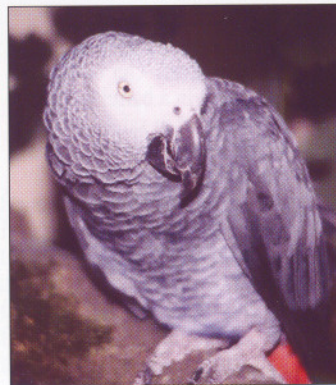
New 'Parrot Sanctuary' adoption bird: "Poppy" the African Grey.

In our May 1996 issue of PsittaScene we announced our wish to create a Parrot Sanctuary,