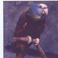
St. Vincent Parrot