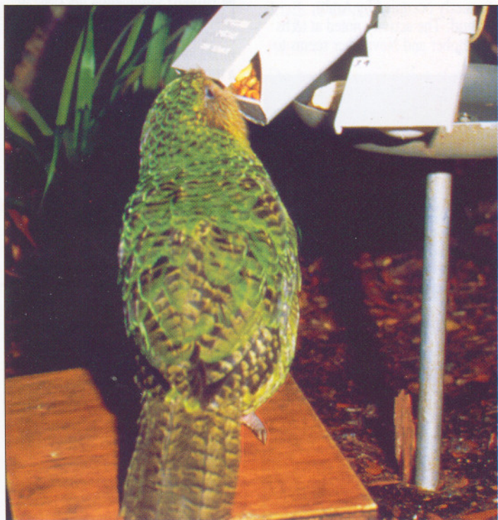
Above: Female Kakapo "Heather" eating from a feeder on Little Barrier Island.

During sampling we found that Fuschia (a female on Maud Island) had a low-grade bacterial infection. We treated her with doxycycline (an antibiotic used previously on