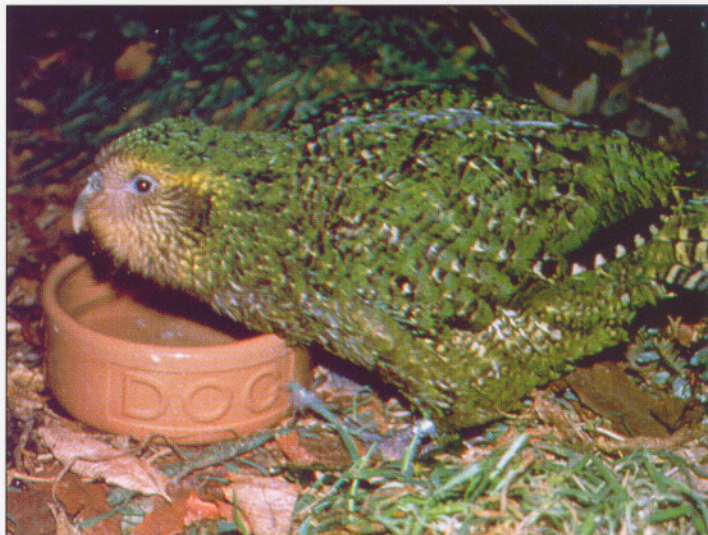
Above: Female Kakapo "Hoki" at three months old.

Also on Maud Island, five-year-old "Hoki" (the only captive kakapo