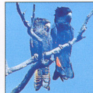
Red-tailed Black Cockatoo