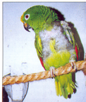
Above: Feather-picked Yellow-fronted Amazon recently rescued by WPT.

The psittacines have managed to fill an amazing array of niches in a diversity of environments; thus I do not think that it is possible to make general recommendations regarding environmental parameters in which distinctive and most probably very important differences occur. I would like to suggest that it is more appropriate for bird owners to try to tailor captive conditions to the conditions and requirements of the particular species (or in some cases even of a particular population) in its natural habitat whenever possible. Catherine E. King, Rotterdam Zoo