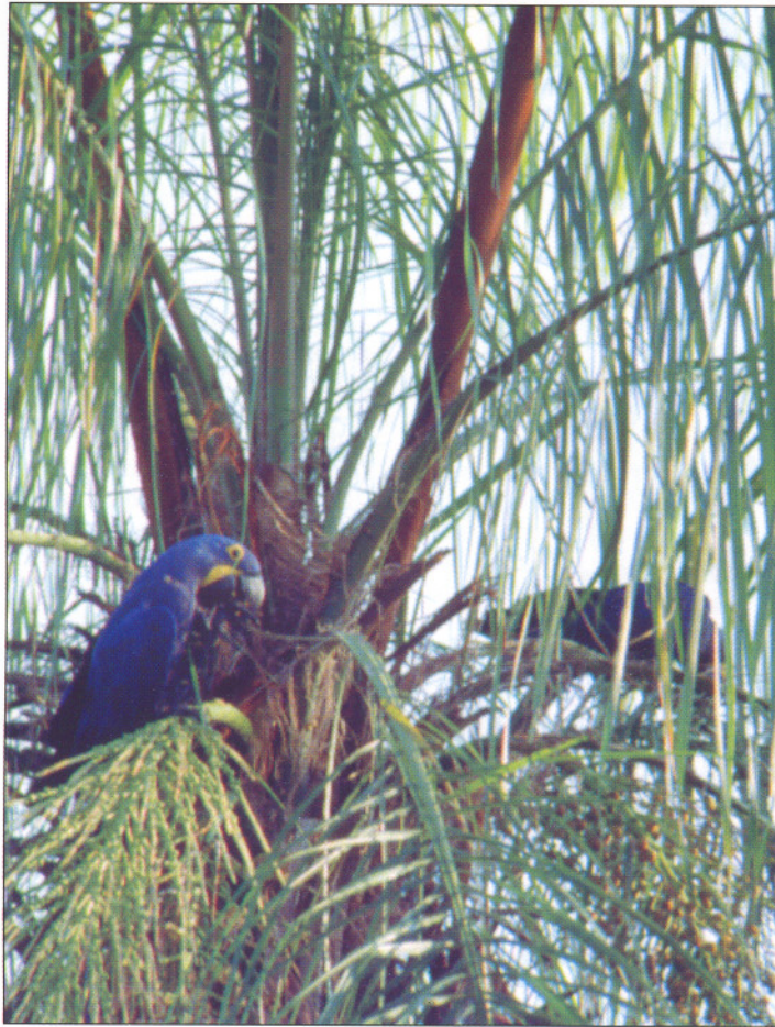
Wild Hyacinthine Macaws feeding on palm nuts

This project entails navigational improvement along the existing Parana-Paraguay waterway, to link five countries of South America; Argentina, Bolivia, Brazil, Paraguay and Uruguay. The project has been put forward as the backbone of the