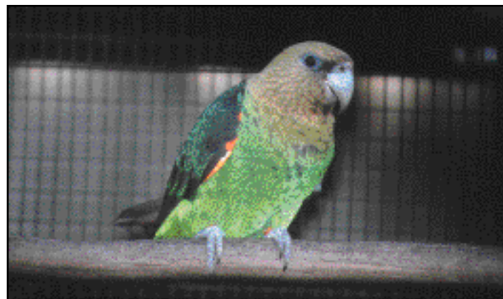
South African Cape Parrot (Male)