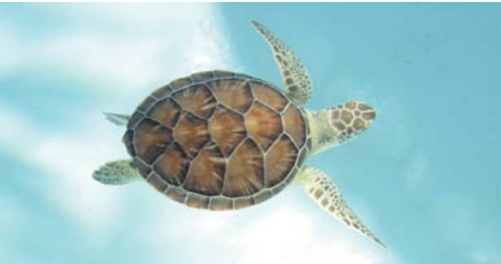
Sea turtles at Xcaret (Mexico) and wild Grand Cayman Amazons were among countless 2012 cruise highlights.