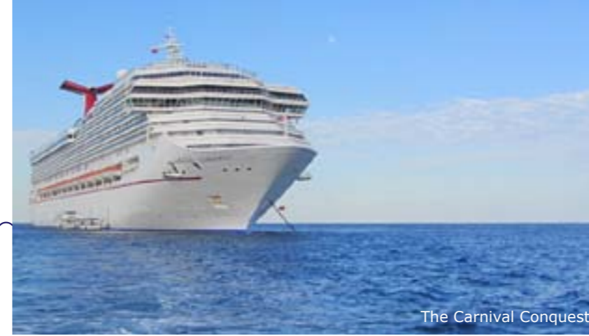
The Carnival Conquest