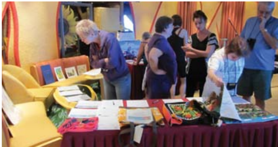
Back on board, the silent auction is full of enticing parrot-related items.