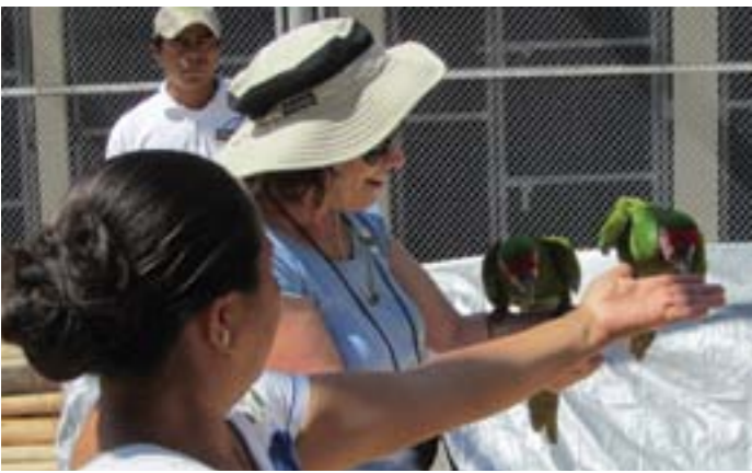
Cruise participants got a chance to work with macaws from the release program at Xcaret in Mexico.