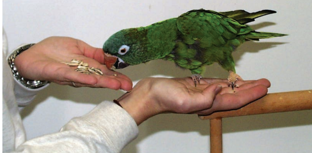
Using positive reinforcement to train your bird to voluntarily step up builds trust and understanding.

A bird that has an unpleasant history with hands may show signs of apprehension or aggressive behavior as it ventures closer to the hand. Generously reinforce the frightened bird that dares to move in closer. If it shows aggressive behavior, gently remove the hand and any positive reinforcers for just a few seconds. This shows the bird that its body language was understood and acknowledged. It also removes the opportunity to gain positive reinforcers. When this strategy is paired with reinforcement of the desired behavior (stepping closer to the hand), the bird can quickly learn to increase calm behavior and decrease aggressive behavior