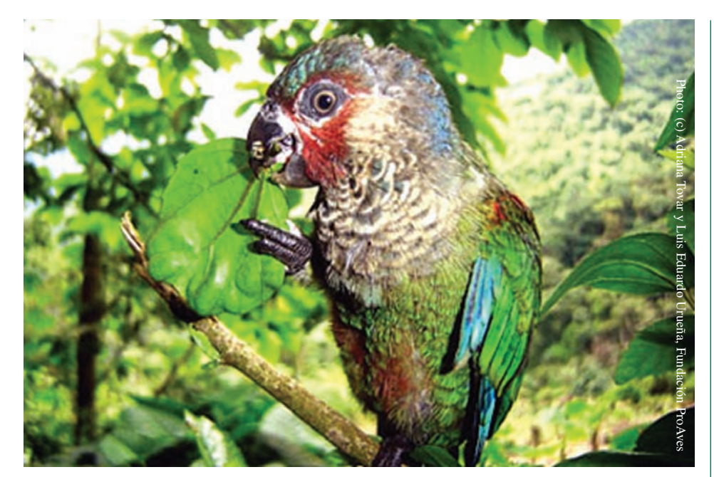
The Perija Parakeet of Columbia.

"Who knows what wonderful biodiversity is being destroyed before it has had a chance to be discovered?"