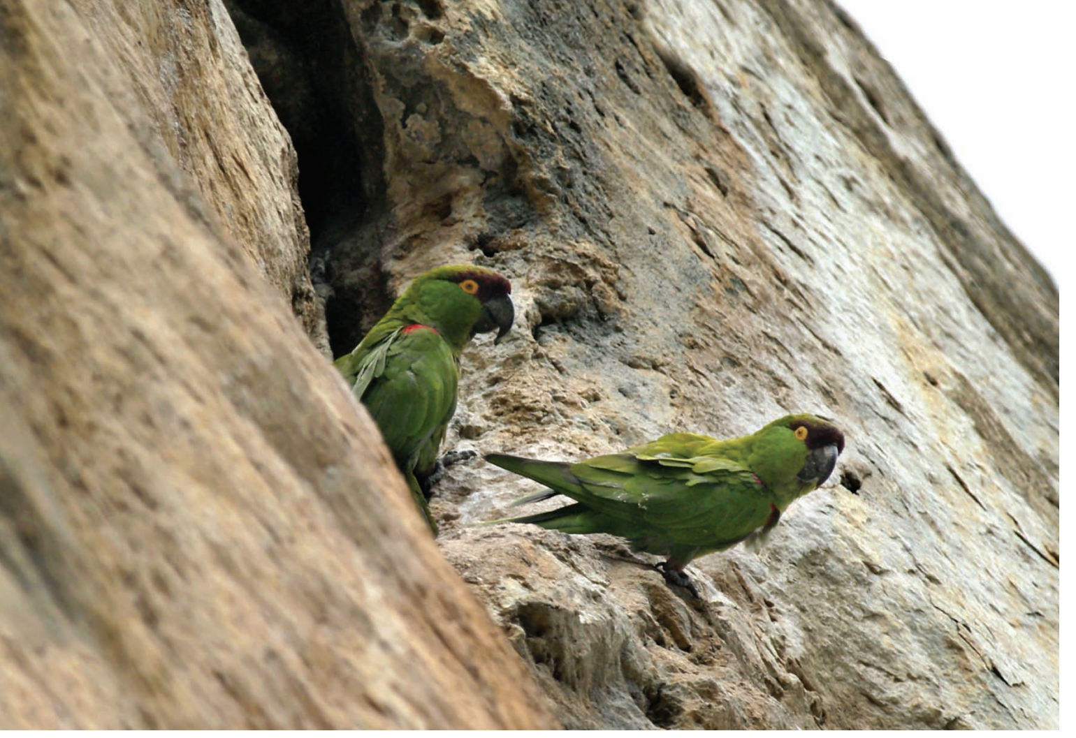
Observations of the Maroon-fronted Parrots reproductive biology, diet and parasitism were essential to the study.

The Ecosystems Sustainable Management Program (PMSE) from Tecnológico de Monterrey, in Mexico oversees the Maroonfronted Parrot (Rhynchopsitta terrisi) project. This long term study started in 1995 and over the years we have been able to identify almost all important nesting areas and study basic aspects of the species' biology such as breeding, diet, home range and habitat use.