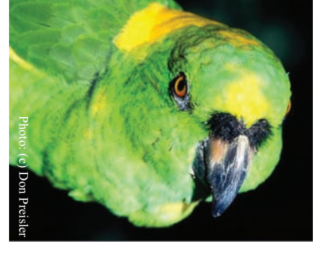
Dispersal, habitat use and population connectivity in the threatened Yellow-naped Amazon of Costa Rica

Our Action Grant program began in 2002 with the award of four grants for projects on the conservation of the world's globallythreatened parrots as outlined in the Parrot Action Plan. We are proud to continue this tradition with the award of five new grants.