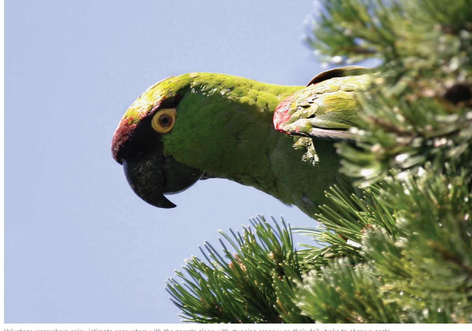
Volunteer researchers enjoy intimate encounters with the parrots along with stunning scenery on their daily treks to observe nests.