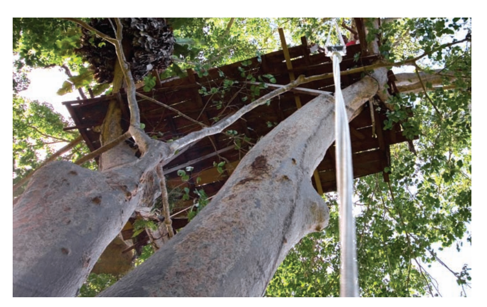
▲ Guests emerge through the jungle canopy at 35 m (115 ft) overlooking a sea of trees and continue skywards to reach the platform.

▲ Seram Island as seen from the the Masihulan "tree house" platform. From this bird's eye view, guests can observe birds that fly by or just underneath.