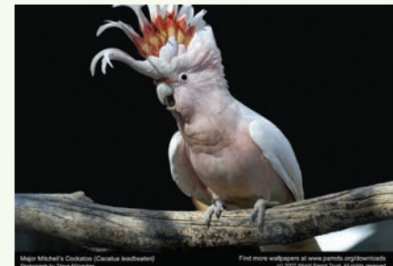
th more added each month.