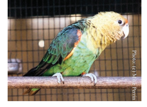
Conservation of the Cape Parrot and associated remnant afro-montane forest (South Africa)

The Endangered Cape Parrot (Poicephalus robustus) is endemic to South Africa. The population is highly fragmented and only lives in Afromontane Podocarpus forest patches. Cape Parrots are dietary specialists feeding primarily on the endocarps of Podocarpus fruits. Nests are almost always secondary cavities high up in dead forest trees, usually Podocarpus species. Low reproductive rate and poor breeding success make the species demographically susceptible to declines in their numbers. Selective felling of Podocarpus species for the furniture industry and capture of nestlings for the avicultural market has pushed the species towards a wild population which numbers less than 1,500 individuals. There is an urgent need for the development and implementation of conservation strategies for both the Cape Parrot and the Afromontane forest. Before such strategies can be developed and implemented, baseline data on the forest ecosystem dynamics and the impact of harvesting on the Cape Parrots distribution needs to be collected. This data will then be used to inform the development and implementation of these strategies, as well as providing baseline data for the ongoing monitoring, evaluation and revision of these strategies.