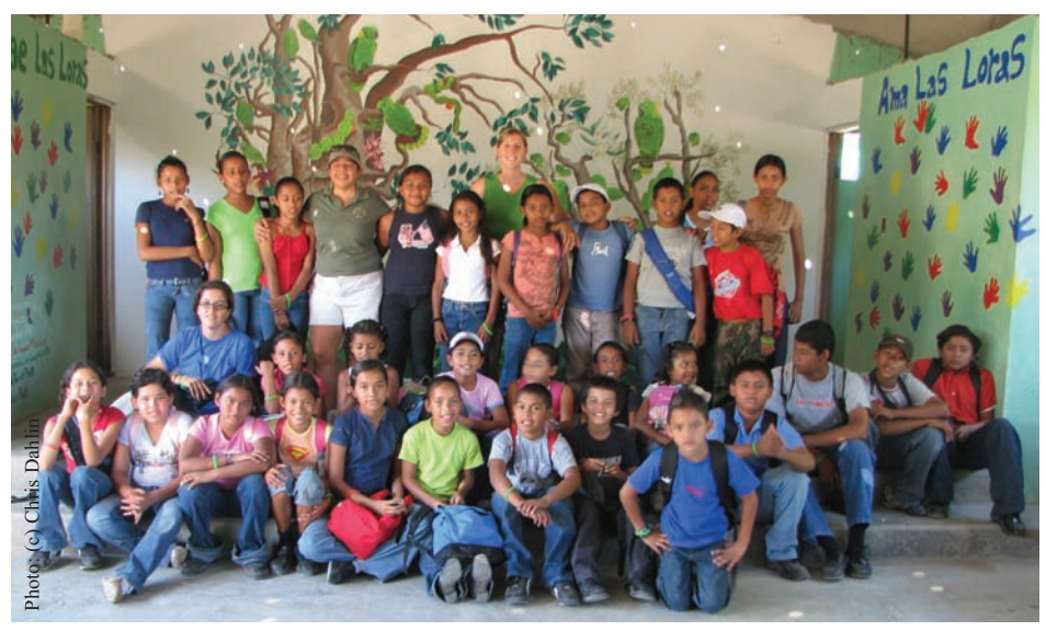
5th and 6th graders wearing their WPT wrist bands with NMSU researchers and ACG staff in front of the mural.

Our first effort was a mixed success. Students' were very enthusiastic throughout the program and thrilled to learn about the parrots. However, poaching continued in 2007 in our field site. In 2008 we will extend our program to more schools and plan to expand the nest adoption component generously sponsored by the WPT. The ACG also plans to bring our parrot education presentation to schools throughout northern Costa Rica. We are confident that with the partnership between the WPT, the ACG and NMSU our program will begin to meet its primary objective of reducing levels of parrot poaching. We also hope our program can serve as a model for other education programs directed at parrot conservation throughout the world.