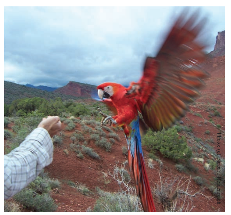
Trainers that work with free-flighted birds rarely if ever use negative reinforcement or aversive stimuli to train.