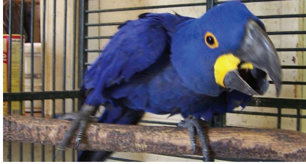
Parrots can learn to bite hands that are used to force behavior.

There can be serious repercussions with lasting effects from using force or aversive stimuli to gain cooperation. One of the most common results of forcing a bird onto your hand is a parrot that learns to bite in response to the presence of a hand (the aversive stimuli). The important word in that sentence is "learns". Parrots are not hatched with an inherent aggressive response to hands. This behavior is learned through repeated exposure to unpleasant interactions involving hands. Often as a last resort, a parrot bites in an effort to deter the persistent pushy hand. Should the bite produce the desired results (the hand going away) the bird