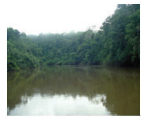
The Cupari is an attractive river to travel on, being bordered by lush vegetation for most of its course. Flocks of Golden Conure are occasionally seen along the river, but for the most part the species is found in the rolling upland or terra firme forests in the area.

time in 2000 to look for Hyacinth Macaws (Anodorhynchus hyacinthinus) after reading Henry Walter Bates' account of the species there in the 19th century (Bates makes no mention of Golden Conure during his expedition). Not only did Gil see hyacinths here, he also unexpectedly found 'ararajubas', the common name for Golden Conure. It is of interest to note that the name ararajuba is an indigenous word for 'yellow macaw'. Recent genetic analysis of neotropical parrots has shown that the natives were right, Golden Conure were shown to be more related to Redshouldered Macaw (Diopsittaca nobilis) than any of the Aratinga parakeets systematists orginally associated it with.