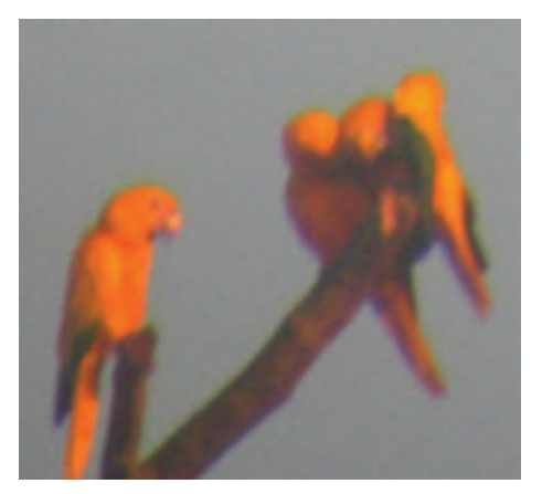
This picture of the Conures preening in the early morning mist was taken through binoculars.