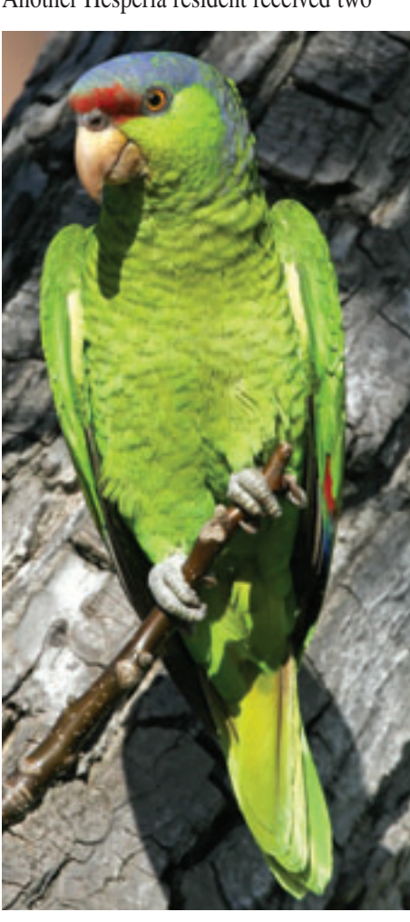
Lilac-crowned Amazons are commonly smuggled across the Mexico-USA border, leading to their uplisting to CITES Appendix I last year.