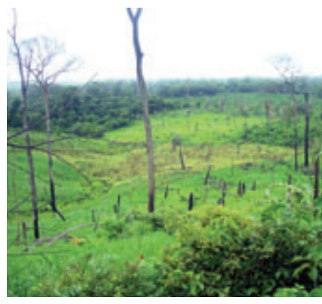
Typical landscape outside the Tapajós National Forest. The land was cleared within the past year by a local farmer to create pasture for his small herd of cattle. A flock of 4 Golden Conure are occasionally seen in this area.

The aim of this study, undertaken in April-May 2004, was to conduct surveys of Golden Conure (Guaruba guarouba) in two reserves located in western Pará. It is a continuation of work done by myself in 2002 in the eastern range of the species along the Capim River south of the state capital, Belem. This area has suffered from heavy deforestation and active poaching pressure on the birds was observed. The state of Pará has lost over 70% of its primary forest as logging, cattle ranching and soy bean production have steadily decimated rainforest in a wave heading westward and northward from the state of Mato Grosso. In contrast to eastern Pará, the western side of the state possesses larger tracts of undisturbed forest, including two large reserves, Tapajós