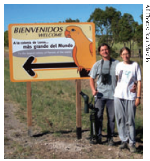
One of the road signs guiding the tourist to the colony.

Since 2003, we have been promoting the importance and necessity of protection of the colony among local people and the national and international community. The former through an educational campaign targeted to children at local primary schools, the latter through divulgation articles in conservation journals. As we announced in PsittaScene Vol 16 No 4 : 16, an educational campaign was carried out in primary schools of Viedma, El Cóndor and San Javier (province Río Negro, Patagonia,