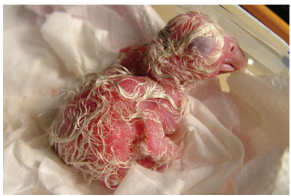
Sarah's newly hatched chick 'Zoe'. Codfish Island 6 April 2005.

Several male track & bowl systems on Pearl and Whenua Hou Islands showed signs of grubbing in October 2004, and activity at bowls increased during November and December. By late December 8 of the 17 adult males on Whenua Hou were booming, and by late January 2005 16 were vocal - including the partially hand-raised male "Sirocco" who resumed occupation of his bowl system on the track to the camp's toilet & attempted to mate with anyone who dared visit the toilet after dark! He was therefore moved to a more remote and safer spot! The only adult male not involved in courtship display this season was RH - the last known survivor from Fiordland - whose genetic contribution is of highest priority! By