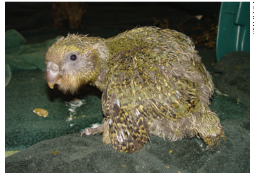
Dit 53 days old.

Signs found at track and bowl systems on Whenua Hou indicated that from early February up to 14 matings, involving ~9 females took place. Ten of the 20 adult females nested and 26 eggs were laid. Eleven of these were fertile and six hatched. One chick died soon after hatching, and since the natural (rimu) food crop failed once again and pellets proved an unsuitable substitute, four of the five surviving chicks were removed from nests for hand-raising. The remaining nestling was attacked and injured by young males while the female was away foraging at night - so it too was removed for handraising. Four fledglings currently survive having been hand-raised in Nelson.