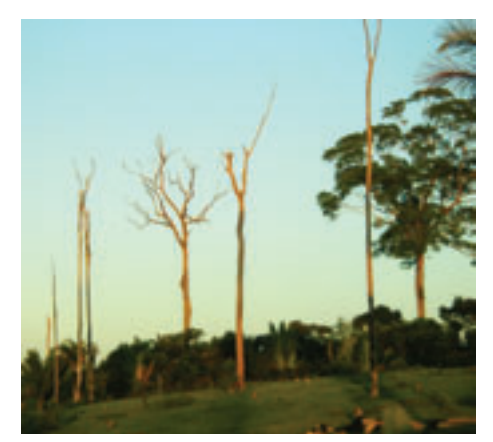
The Golden Conures penchant for isolated snags for nest or roost trees brings them into contact with humans when they select trees in cow pasture, for example here along the transamazonica highway linking Pará to Rôndonia.

Park guards told me I was fortunate to find the conures during my stay as flocks seemingly disappear for months on end. Whether birds are moving into areas deeper within the park or migrating out of its borders is presently unknown. I was told one story, however, of a nest tree located close to the park's entrance in cattle pasture. This nest was cut down by the land owner to gain access to nestlings. Such stories are tragic because not only are chicks likely killed in the process but a valuable nest site is lost for untold numbers of future nesting attempts. Although I was unable to locate nest trees in the park during my visit, I've recently been informed that one nest has been found in a lagoon bordering the main road which passes along the park's eastern border. This is good news for future park visitors as there now exists a potentially reliable location for Golden Conure viewing. As conures are the most sought after species by guests to the park, it has recently become it's symbol, being prominently featured on the cover of a newly published educational pamphlet. Personally, it's a relief to know that protected areas exist for Golden Conure populations. Such is not always the case for other threatened neotropical parrots such as Blue-throated Macaw (Ara glaucogularis) and Redfronted Macaw (Ara rubrogenys).