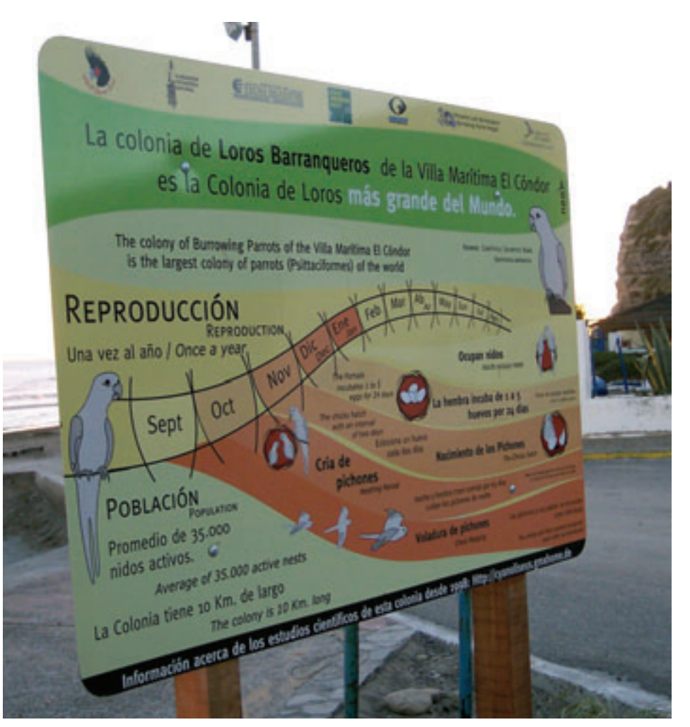
One of the road signs providing information about the colony and the parrots.

San Javier. We expect to soon get official permits for extending the educational campaign this year to the nearby city of Carmen de Patagones in the province of Buenos Aires. And we will conduct more guided visits during next breeding season in October-December.