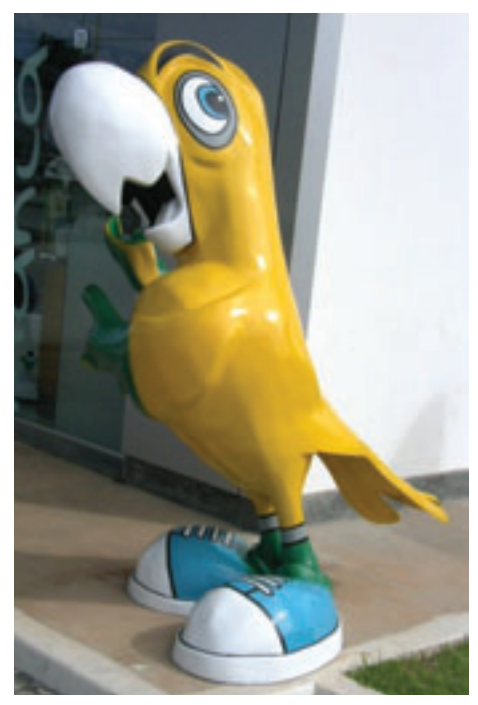
Brazil's national gas company, PetroBras, has chosen the Golden Conure as it's mascot, thus this five foot cartoon effigy of the species is found at hundreds of service stations across the country. Hopefully this raised profile for the species will translate into more concern for those flocks which still persist in the wild.

conservation efforts in both regions of the species' range can be initiated, applying a different suite of methods in each case.