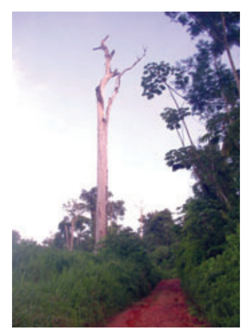
A Golden Conure nest tree located directly next to the road connecting a Cupari River community to the Transamazonica highway. The landowner where the tree is located is proud to have the birds on his land and has prohibited anyone from climbing it to take chicks. A flock of 12 conures were observed at dusk briefly visiting this tree in late April before flying to another unknown roost site, suggesting postfledging dispersal following the breeding season.

Despite the presence of Golden Conure on the non-reserve side of TNF in conspicuous roosting trees, I saw no evidence of nest poaching there. This is strong contrast to the Capim River survey in 2002 where I was offered chicks on numerous occasions for as little as us$10! The most obvious threat to the species along the Cupari is the continued deforestation opposite the reserve's borders, as local farmers clear forest to grow subsistence crops such as rice and manioc. Several times I found a flock of conures feeding on murucí seeds (Byrsonima crassifolia) in forest fragments recently separated by the clearing of 2 ha of forest to plant a meager amount of rice. While it may be argued that deforestation outside the reserve is inevitable, any continued habitat loss for the species, no matter where it lies, should be addressed