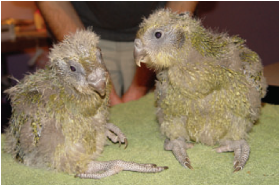
Dit and Dot at 22 days old.

It is not practical to pick tiny green rimu fruit in sufficient quantity for storage and