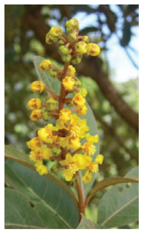
Flowers of the murucí tree. The fruits of this tree are the most often cited food item of Golden Conures by locals in western Pará. People also collect the fruits to make juice and ice cream.

mighty Tapajós River. Murucí fruits are the shape and size of blueberries with two 3-5mm seeds encased in a hard, black seed pod. I was able to observe conures daily while in the park due to the discovery of a 2 ha grove of murucí trees frequented by two flocks of birds. On one occasion I witnessed the smaller flock of 10 birds chase the larger 14 bird flock away from a fruiting tree. Although only one observation, this may suggest that Golden Conure family units maintain and defend foraging territories from one another.