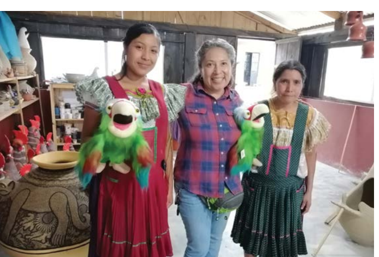
Top, left: A White-fronted Amazon feasts on a nutritious mix Top, right: Local women take part in Embroidering Con Causa (Embroidering with a Cause) creating nature-themed goods. Other small businesses sell organic coffees and more, all benefiting people and parrots Bottom, right: Colourful and fun educational props for serious messaging